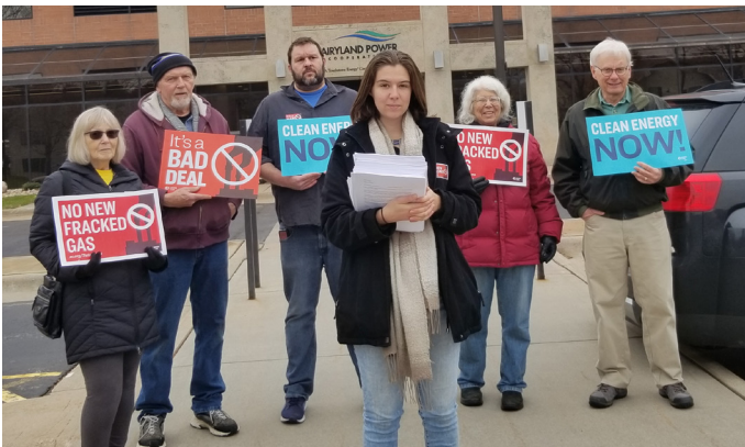
Leaders of the Coulee Region Group deliver petitions in opposition to the NTEC gas plant to Dairyland.

NEITHER A “BRIDGE FUEL” NOR “NATURAL,” “CLEAN,” OR “ECONOMIC”