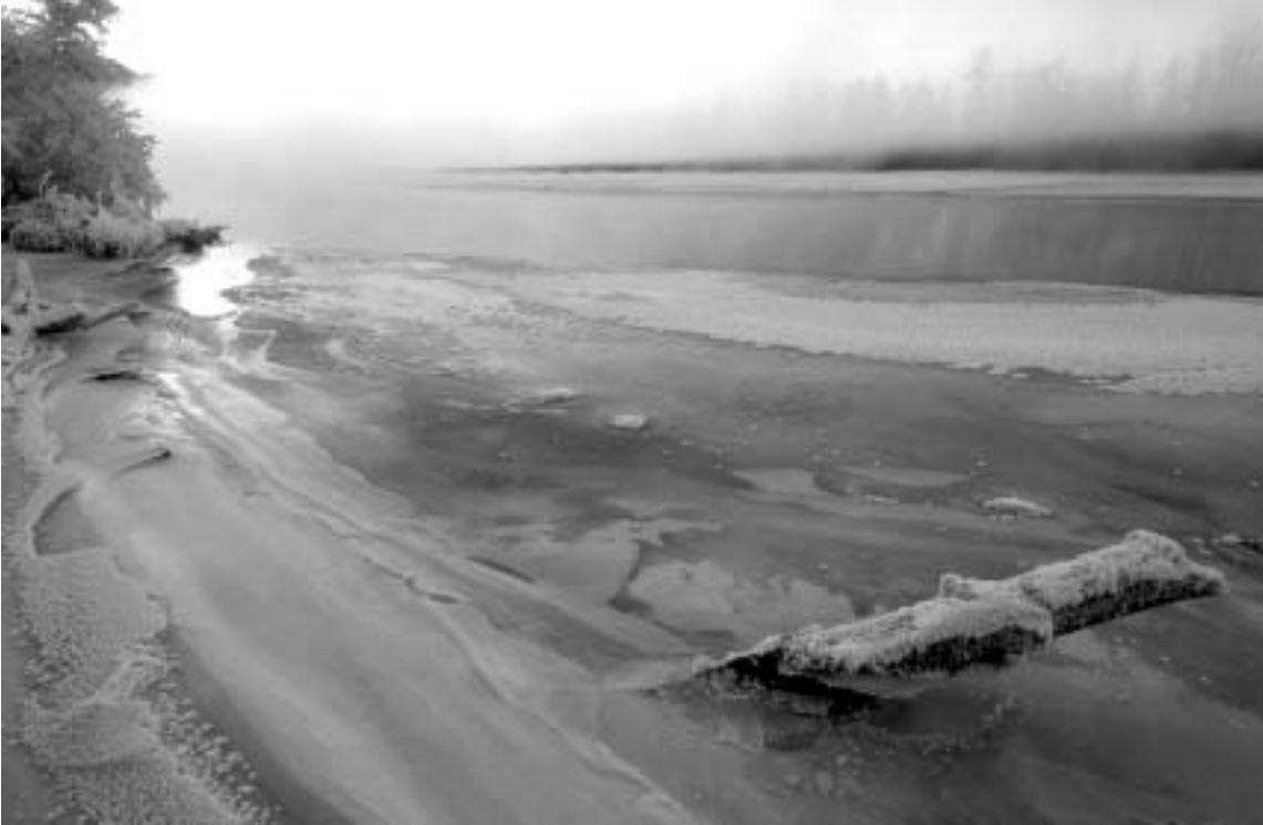
Knik River

Legislation has been introduced to create a Knik River Public Use Area for approximately 400 square miles adjacent to and just north of Chugach State Park. This includes the area along the Knik River from the Old Glenn Highway bridge up to and past the Knik Glacier. Known for out-of-control off-road use, air-boating and burned-out cars, there is a definite need for more enforcement of current regulations.