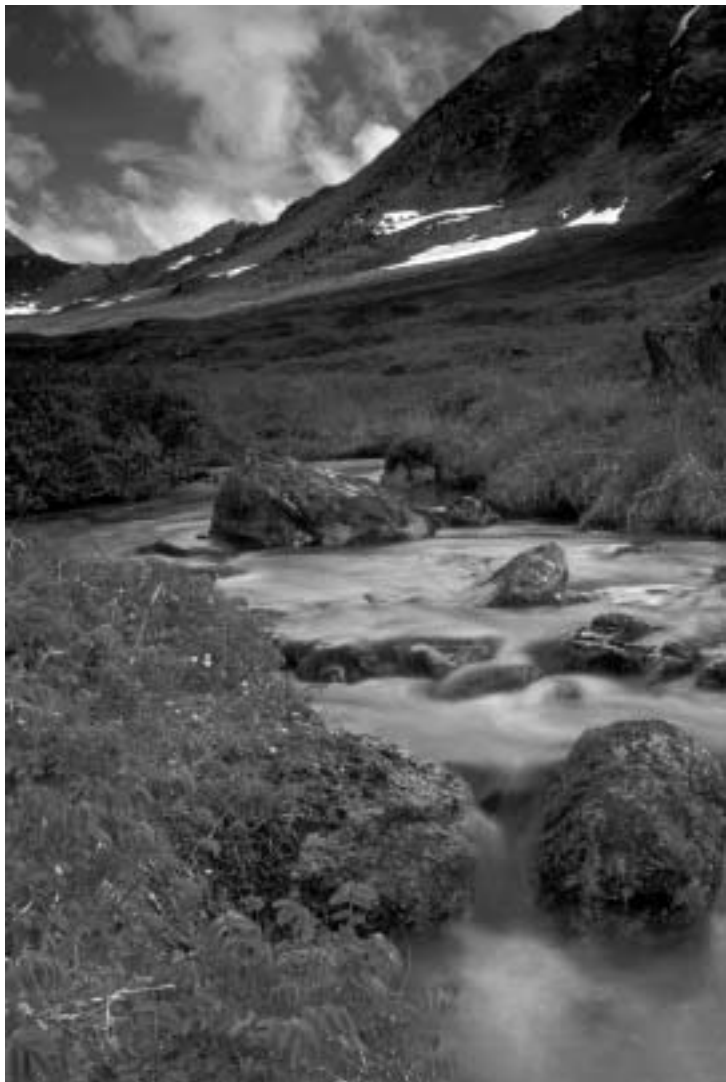
Hatcher Pass

will.taygan@alaska.sierraclub.org or Friends of Mat-Su, foms@mtaonline.net (907) 746-0130 POB 116 Palmer, AK 99645