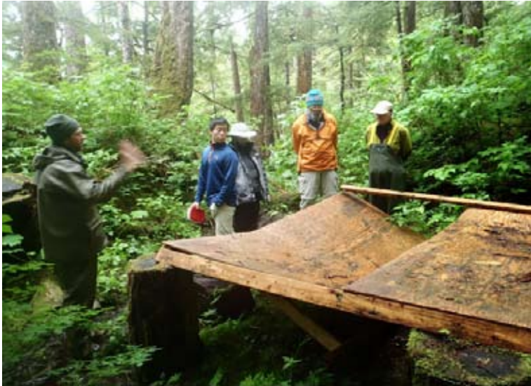
Trip members hard at work dismantling an abandoned old work camp on Knight Island -- to restore the area's wilderness character

coho salmon freshly caught by Barbara Lydon and grilled over a beach fire.