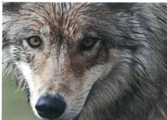
Denali Wolf.

The wolf population across the six million-acre national park and preserve has declined from 147 wolves in fall of 2007 to 49 in spring of 2016. This decline has reduced the opportunity for half a million visitors to Denali Park to view wolves. ( sierra borealis , Dec 2013) The economic value of living wildlife to the state of Alaska far exceeds the value of wolf pelts, bear hides, etc. In 2011, wildlife viewing activities supported more than $2.7 billion of expenditures--twice as much as the $1.3 billion provided by hunting activities in Alaska in 2011. Denali National Park contributes over $560 million per year to Alaska's economy. It is the third largest revenue-generating park in the nation.