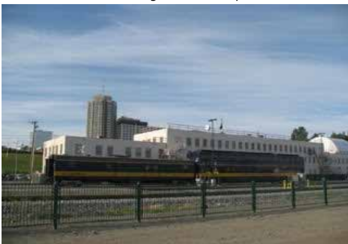
Commuter rail: reducing congestion and CO2 emissions