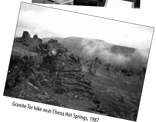
Granite Tor hike near Chena Hot Springs, 1987