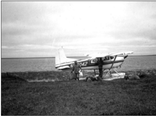
Don Ross's float plane lands in the Arctic Refuge 1987-