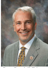
Rep. Randall Friese (D-9)