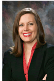
Sen. Katie Hobbs (D-24)