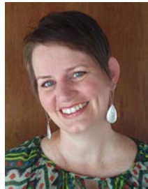
Rep. Celeste Plumlee (D-26)