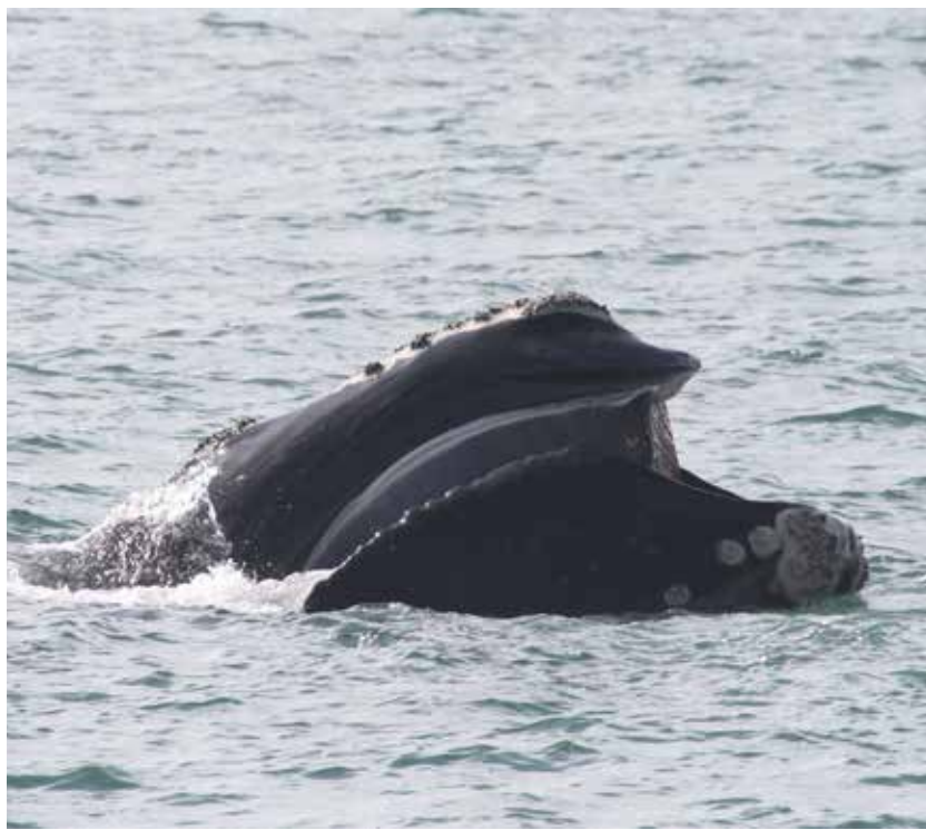
The North Atlantic right whale may be one of the species threatened by the warming in the Gulf of Maine.

Public comment was heard in an open session in Baltimore on September 25.