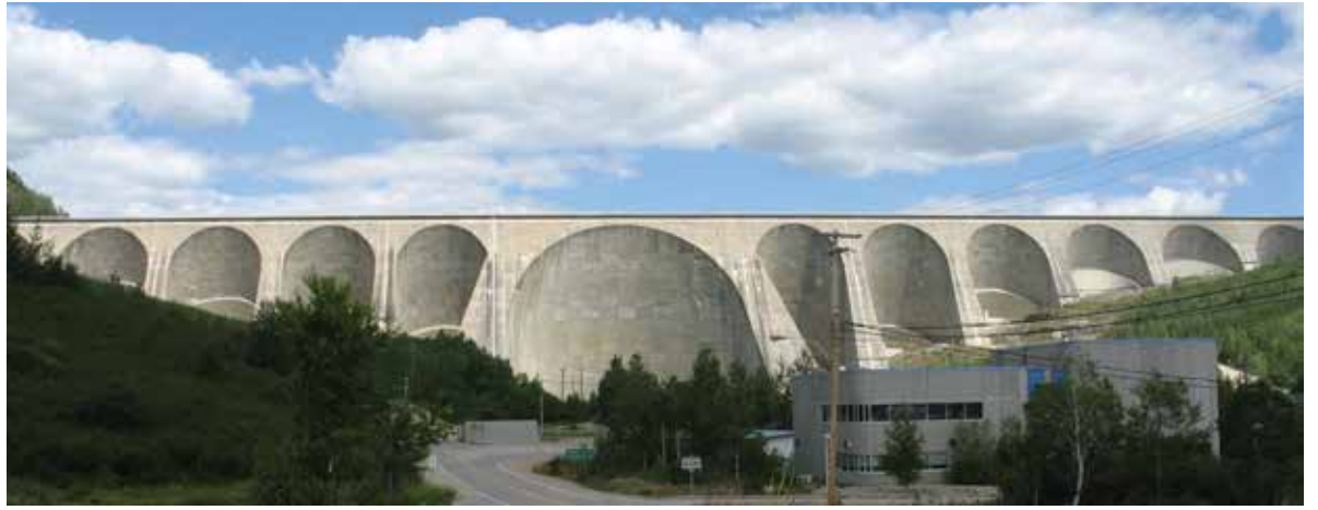
Hydro-Quebec's Barrage Daniel-Johnson Dam on the Manicouragan River in Quebec Province.

One hundred years of Canadian hydropower has permanently destroyed hundreds of thousands of square miles of land and rivers, eliminated natural flow regimes, and caused toxic water pollution. In many communities water is unfit for drinking and swimming, wildlife has lesions, and fish like sturgeon are nearly extinct as shown in testimony from Canadian Senator Mary Jane McCallum, an Indigenous woman from Barren Lands First Nation