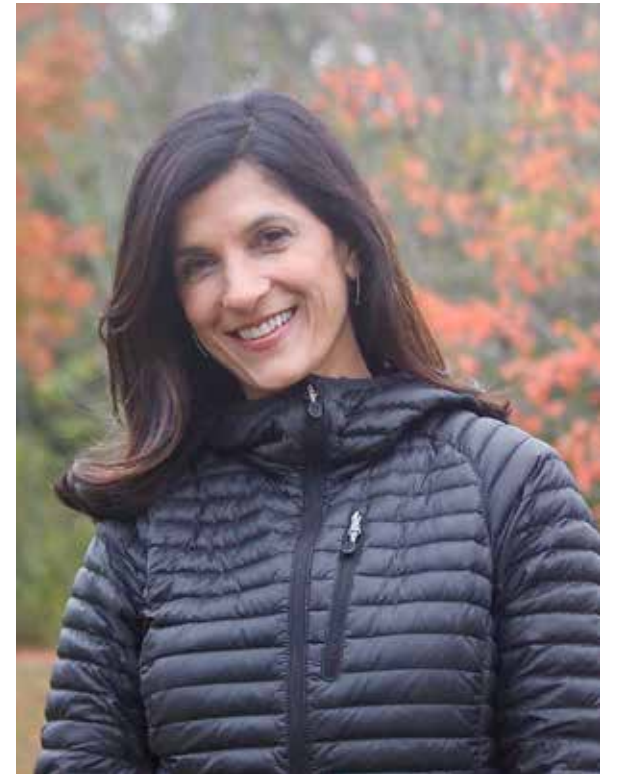
U.S. Senate candidate Sara Gideon and presidential candidate Joe Biden will put the country on the right track for solving the multiple crises of climate, the pandemic, systemic racism, and economic inequity.

health, our water, our public lands, and our wildlife.