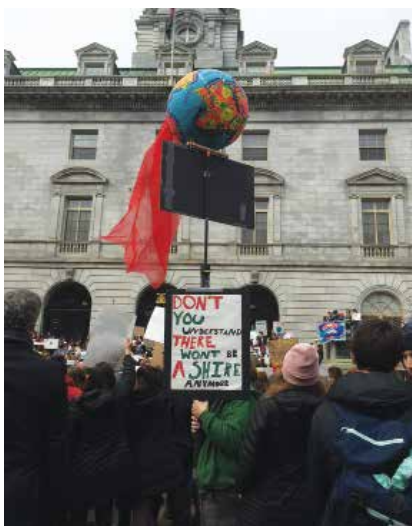
Students rally at Portland City Hall on March 15.

Sierra Club Maine has joined with student groups and several other organizations in an effort to elevate the voices of youth around the climate issue.