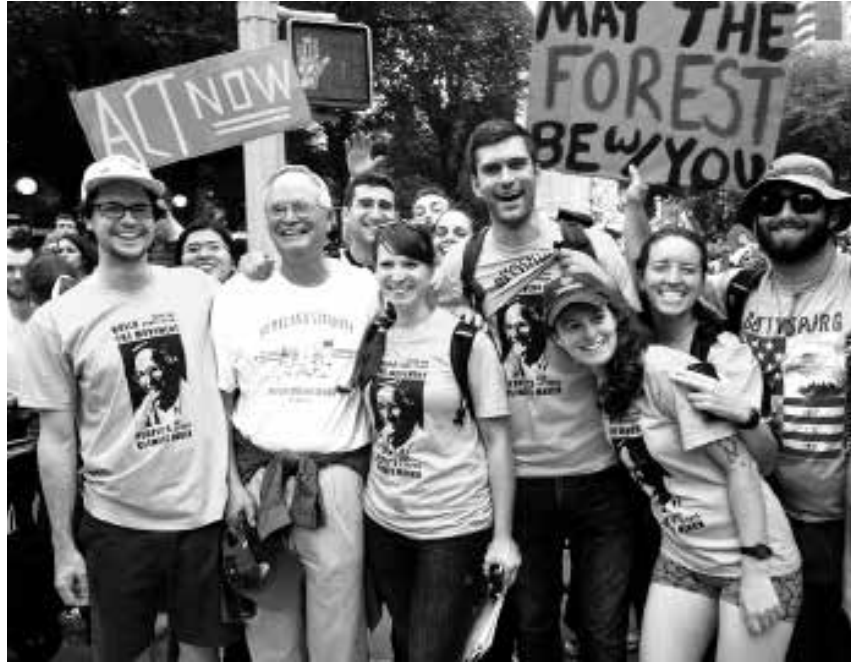
In September 2014, Gus Speth joined his students from the Yale School of Forestry and Environmental Studies in the New York City Climate March.

Well, what is an environmental issue? Most of us would say air pollution, water pollution, loss of habitat, etc. But what if your answer is that an environmental issue is anything that impedes environmental progress? That’s a much different way of looking at it. And if you think of it in that way then Trump putting all our emphasis on economic growth is an environmental issue. Consumerism