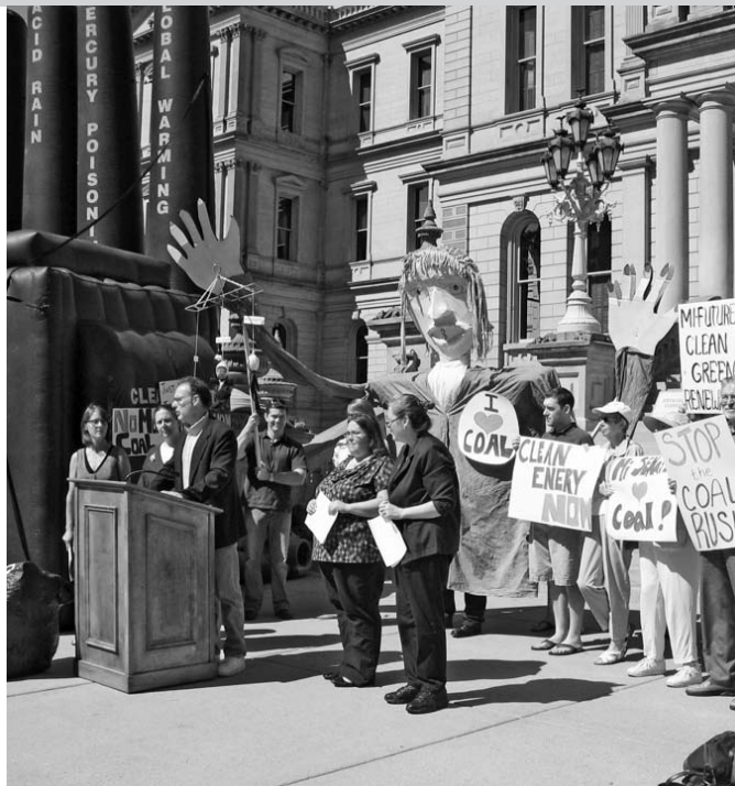
An inflatable coal plant and 13' puppet help environmental and faith-based groups make the case against the Michigan Senate's abysmal energy bills passed in July. We're now working towards an improved version of the Senate energy package this fall.