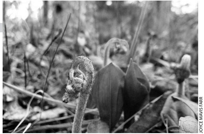
JOYCE MAVIS FARR

At over 50,000 acres of both Ottawa National Forest and private lands, there is plenty of room for protected areas, recreation-intensive areas, and timber production areas. The Trap Hills Conservation Alliance, including Sierra Club, is advocating a