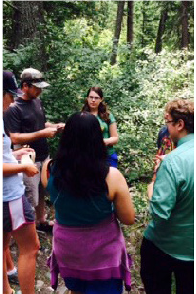
During the outings youth and volunteers participated in creative skills-building activities focused on leadership development and team building.

As their confidence and enthusiasm grows, local youth are being encouraged to take ownership of the program by becoming part of our planning team to help organize future outings as well as recruit their peers during the upcoming hiking season. We also hope to build on our initial success by offering other experiences involving a wider network of volunteer mentors, to deepen participants' connection with the outdoors, inspire dedicated stewards of wilderness, and create an enduring desire to protect our wild spaces.