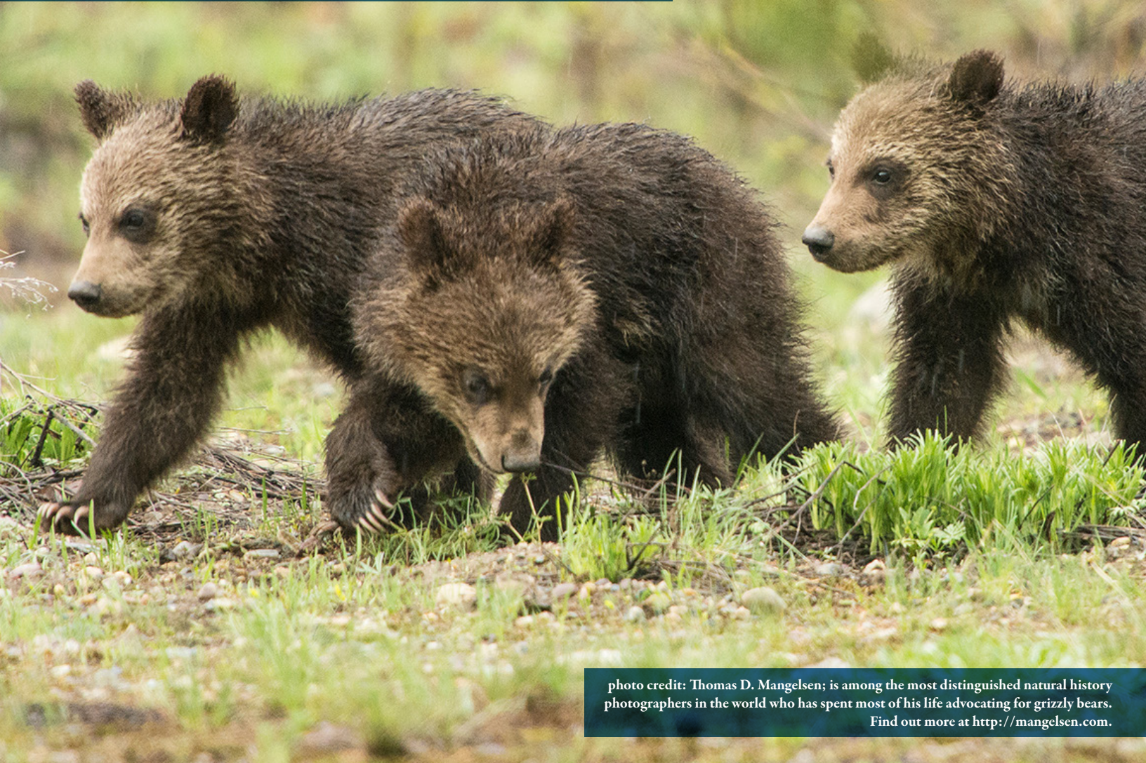
photo credit: Thomas D. Mangelsen; is among the most distinguished natural history photographers in the world who has spent most of his life advocating for grizzly bears. Find out more at http://mangelsen.com .

In order to ensure the long-term future of grizzly bears and their full recovery across the lower 48, we must have a thriving, connected, and well-distributed “metapopulation” of several thousand bears. There must be natural connectivity between Greater Yellowstone and other grizzly ecosystems so bears can find food and mates. Stronger protections for bears and their habitat is needed, particularly in linkage areas, and bears must be able to move into new areas of biologically-suitable habitat. Human-caused mortality of grizzlies must be reduced, and there should be no trophy sport hunting of grizzly bears.