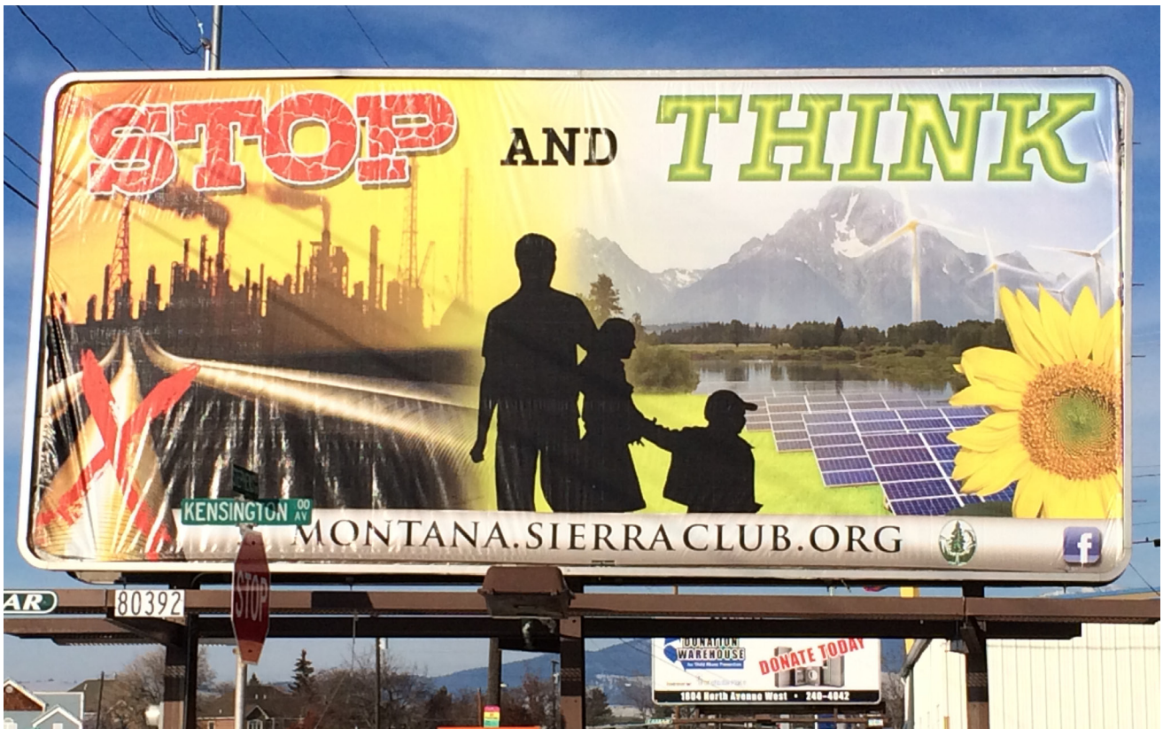
Montana Chapter billboard in Missoula December and January.

Printed on 100% post-consumer, recycled, chlorine-free paper PLEASE RECYCLE