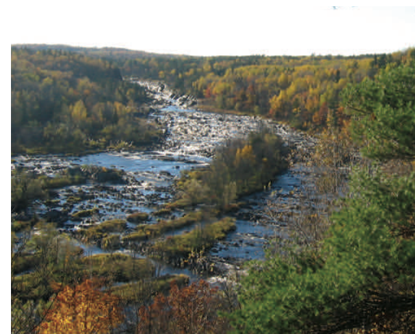
St. Louis River