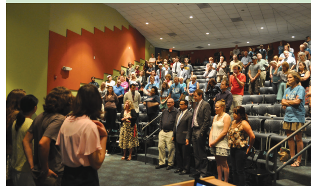
Clean Power Plan Celebration