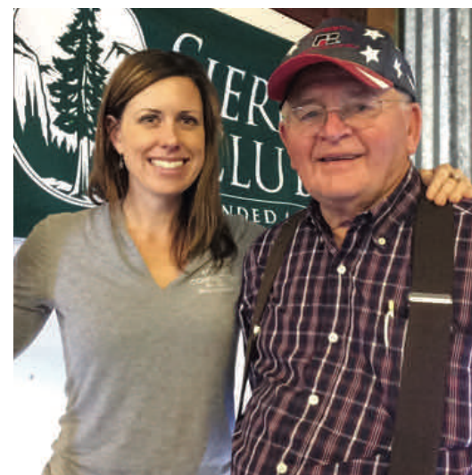
Sierra Club volunteers reach out at the Olmsted County Fair in July

With major new development planned for downtown Rochester as part of the Destination Medical Center (DMC), with the RPU survey results, with the coming adoption of a new Comprehensive Plan and Energy Action Plan -- opportunities for changing “business as usual” in Rochester are many.