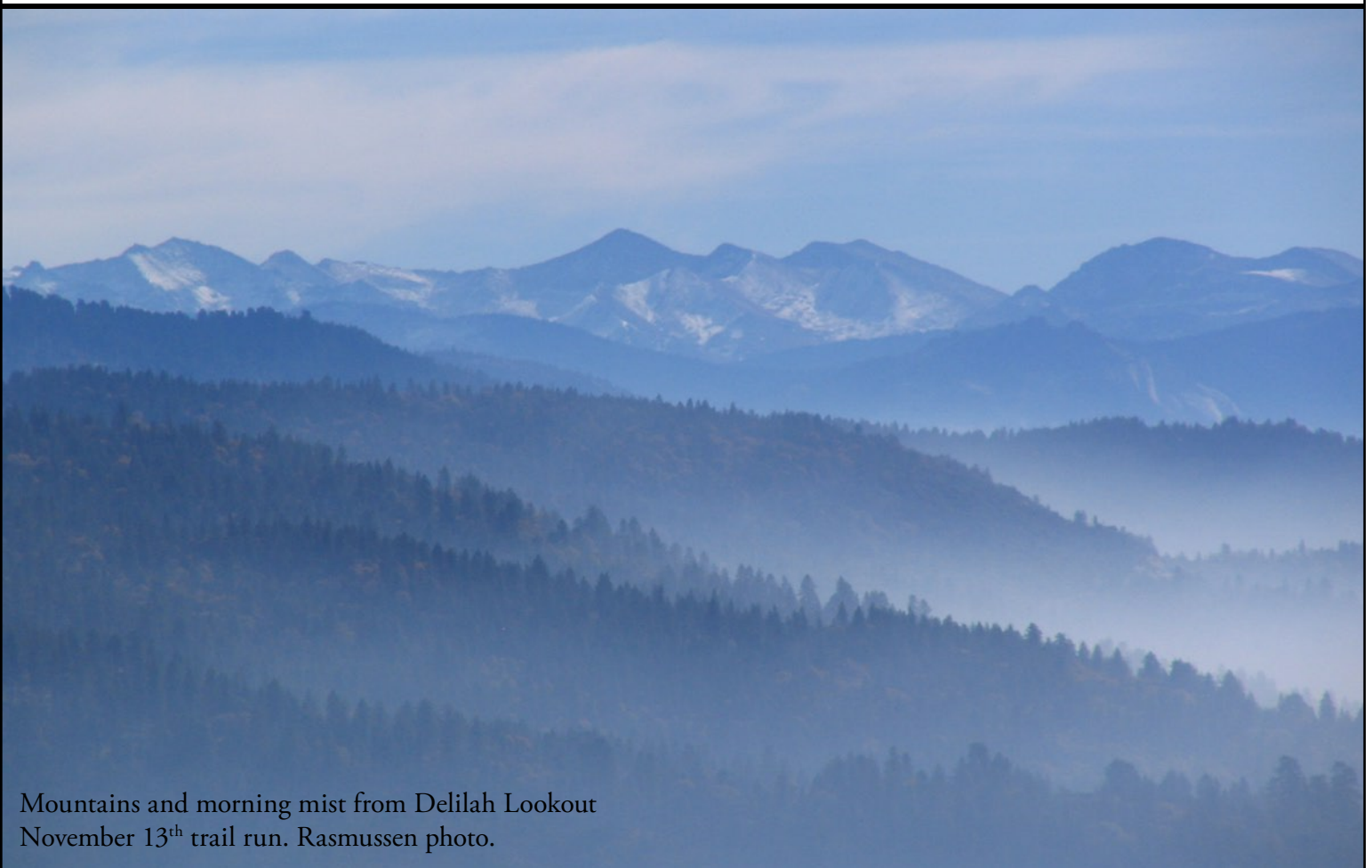
Mountains and morning mist from Delilah Lookout November 13 th trail run.

January Tehipite Topics deadline December 9 th .