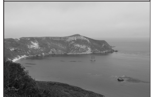
Cuyler Harbor, San Miguel Island

Prop 25 would move us closer to fiscal sanity and remove one avenue for anti-environmental legislative schemes.