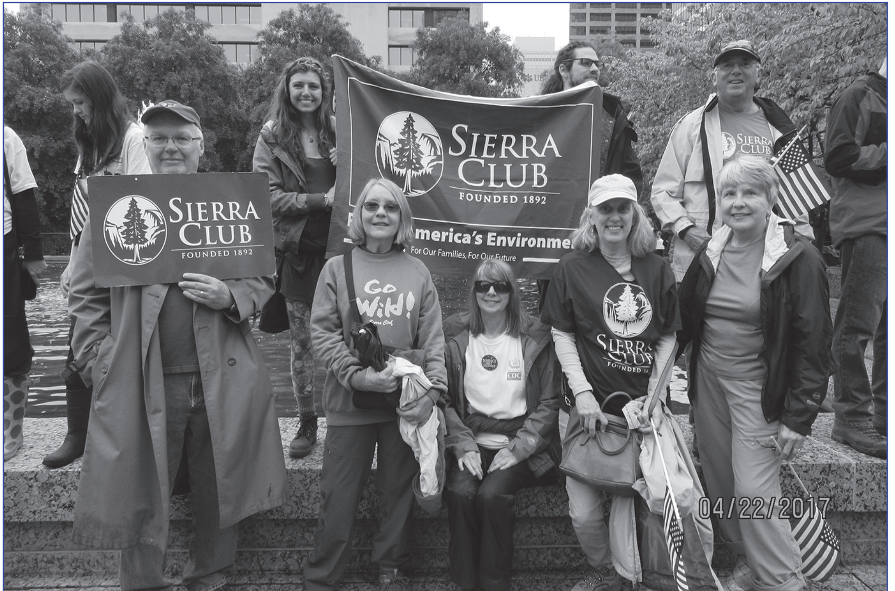
"Despite the thunderstorms, MTG (and an estimated 3,000 others) turned out for the Nashville Science & Climate March. MTG was a co-sponsor of the event."

Tennes-Sierran 3712 Ringgold Rd., #156 Chatanooga, TN 37412-1638