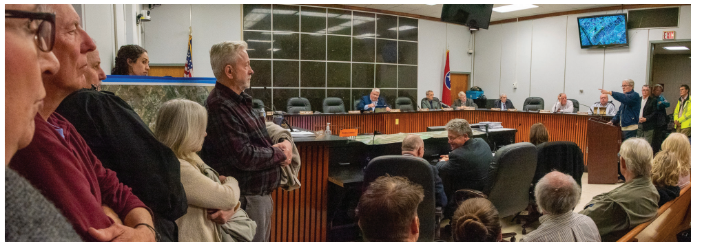
Above, nearby resident speaks out.

The county is insisting the Thacker case ruling that TVA is a public utility, not a government entity, means it's subject to Anderson's Jackson Law, barring it from