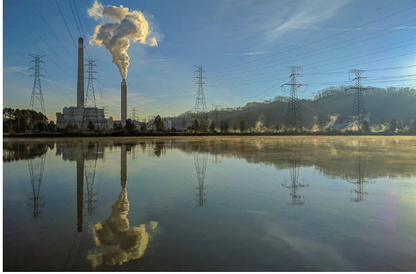
Bull Run Fossil Plant reflected in Melton Hill Reservoir

Although the Tennessee Department of Environment and Conservation (TDEC) is the regulating agency which mandated and now oversees the ongoing Bull Run Environmental Investigation Plan (EIP) for which the testing is primarily being conducted,