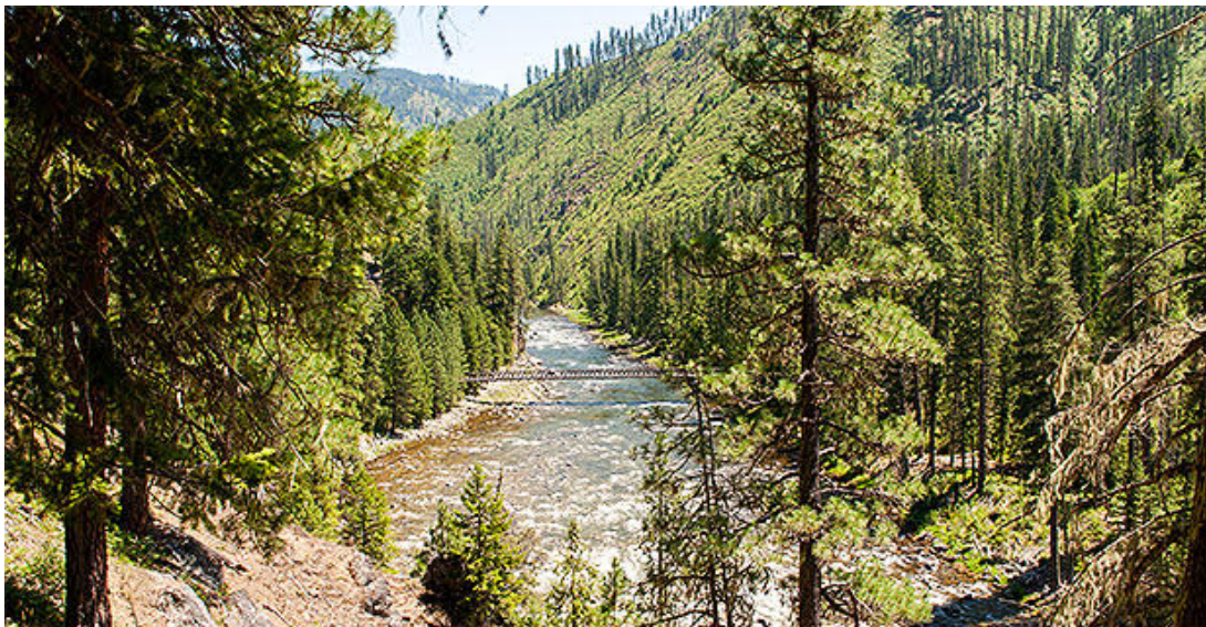
The Selway River in Idaho.