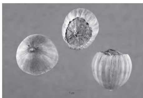
Seeds of Corylus cornuta

Starting in 2009, The Hazelnut Improvement Program was founded by a cooperation between the University of Wisconsin and the University of Minnesota. Seed suppliers like Badgersett in Minnesota have been making