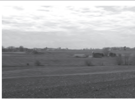
This farm has unsafe water whenever it rains due to the run off that comes from the 'mountain' of old manure across the road from their home.

Last fall, I attended a CAFO bus tour organized by Kewaunee CARES, and I was shocked by what I saw, including unlicensed CAFOs and areas where too much manure was being spread way too close to sensitive waterways. And there are proposals on the books to increase