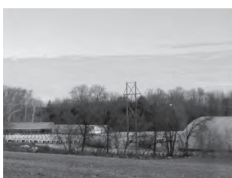
A calf ranch, operating without a permit, has thousands of calf huts within eyesight of a stream. EPA tested the water near this operation and found it seriously polluted.

the number of cows in the county to almost 60,000, increasing the amount of manure that must be disposed of in the area. Robert Martin, Director of the Pew Commission on Industrial Farm Animal Production, states, "The present system of producing food animals in the United States is not sustainable and presents an unprecedented level of risk to public health and damage to the environment, as well as unnecessary harm to the animals we raise as food." ☞