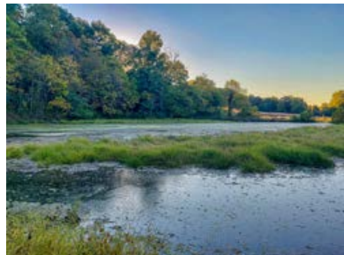
A wetland in Dickson County that might be negatively impacted by the proposed pipeline project.