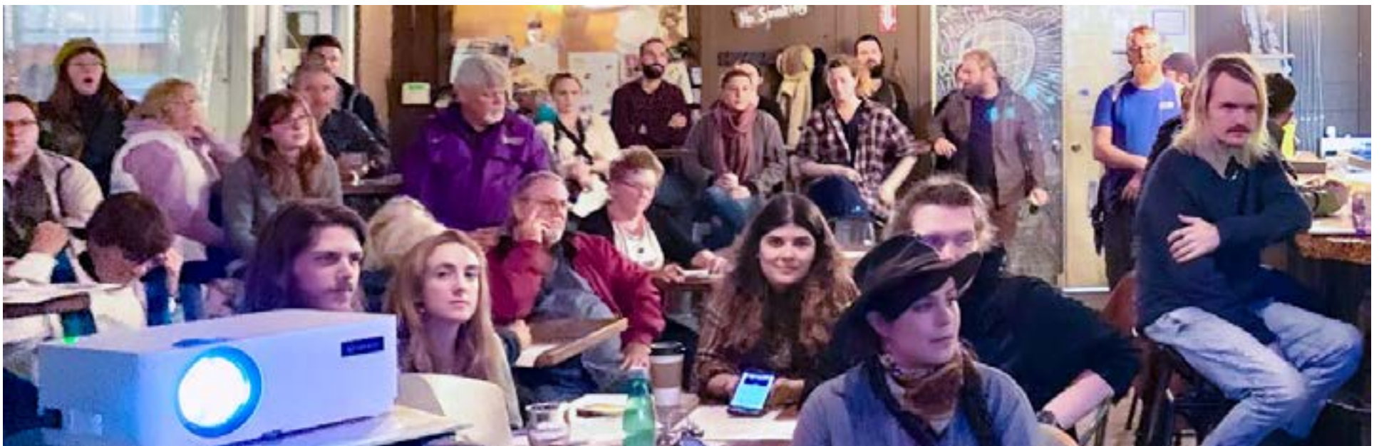
Concerned residents in Tennessee’s Upper Cumberland Region gather for a People’s Town Hall to learn about the Ridgeline pipeline in December 2022. This methane pipeline would be built to supply TVA’s proposed gas plant replacement for Kingston coal plant. The town hall was organized by community leaders who went on to form the grassroots group SAGE TN (Safe, Affordable, Good Energy for TN) in opposition to the gas plant and pipeline. Also see story on page 7.