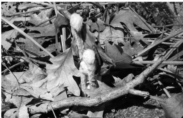
Fern unfurling April 28th

If you are a member of an organization in our area and would like to explore a collaboration with the Crossroads Group of the Sierra Club, we would love to hear from you. Please contact us at: cg@michigan.sierraclub.org