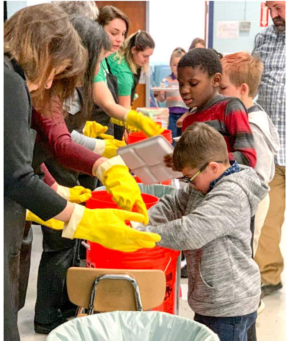
Teachers and students at West Meade Elementary School in Nashville organize surplus cafeteria food.

At the audit's conclusion we learned that there was money left in the grant. Knowing that food took up precious space in our landfill and it produced a lot of methane (a gas 25 times more potent for climate change than CO 2 ),