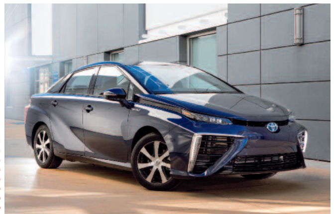
2016 Toyota Mirai FCV