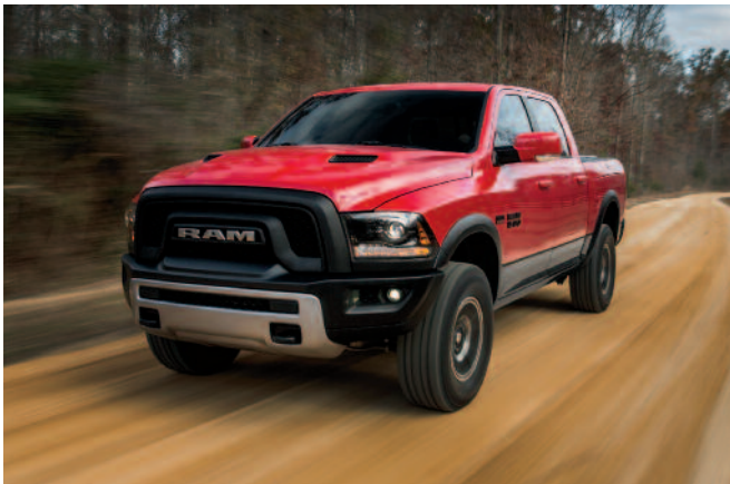
2016 RAM 1500