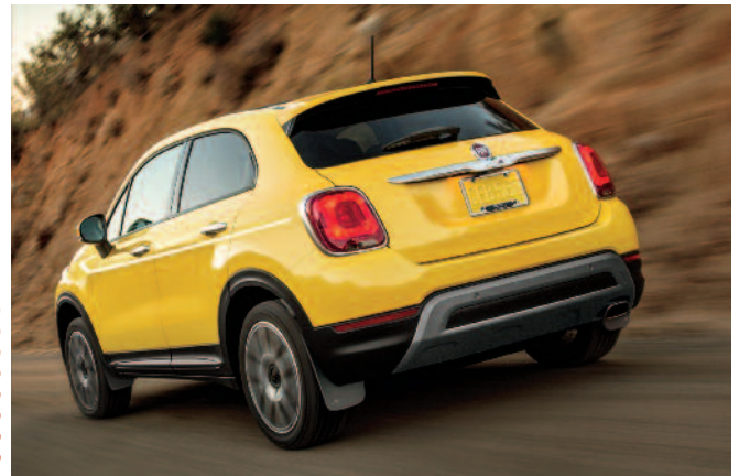
2016 FIAT 500X