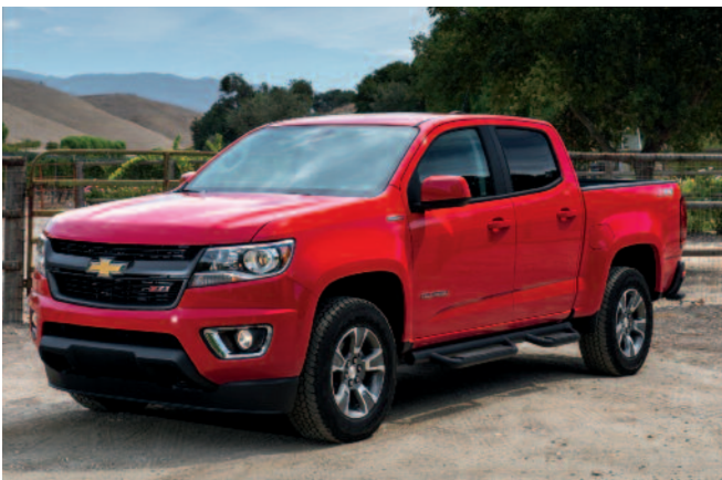
2016 Chevrolet Silverado Diesel