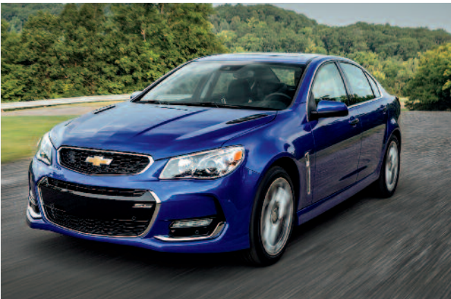
2016 Chevrolet SS

Scion iA Scion tC Scion xB Subaru Impreza Subaru Legacy Subaru WRX Toyota Avalon Toyota Camry Toyota Corolla Volkswagen Beetle Volkswagen CC Volkswagen Jetta Volkswagen Passat