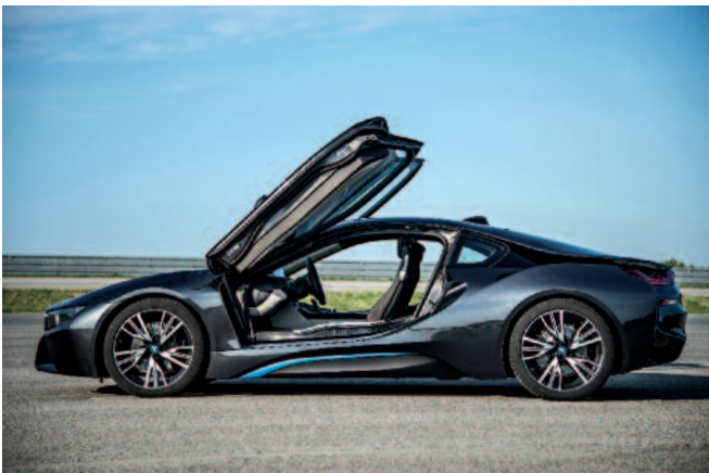
2016 BMW i8

Toyota Avalon Hybrid Toyota Camry Hybrid Toyota Highlander Hybrid Toyota Mirai FCV Toyota Prius Hybrid Toyota Prius Plug In Toyota RAV4 Hybrid Volkswagen Golf EV Volkswagen Jetta Hybrid Volkswagen Toureg Hybrid