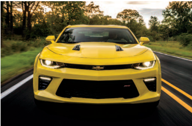
2016 Chevrolet Camaro

Aston Martin DB9 Aston Martin Rapide S Aston Martin Vanquish Aston Martin Vantage Bentley Continental Bentley Mulsanne Lamborghini Aventador Lamborghini Huracán Lotus Evora Maserati Ghibli Maserati Gran Turismo Maserati Quattroporte Rolls-Royce Dawn Rolls-Royce Wraith