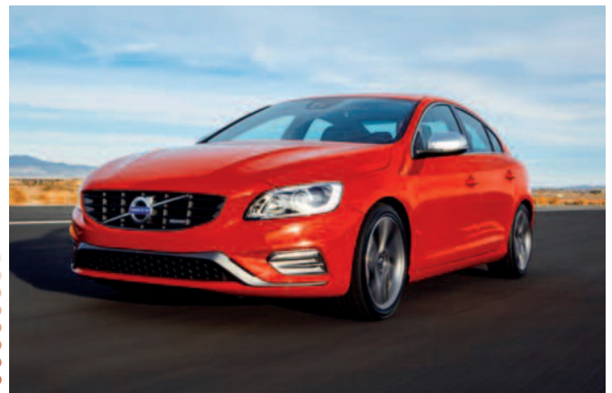
2016 Volvo S60