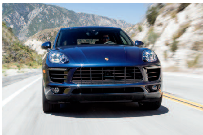
2016 Porsche Macan