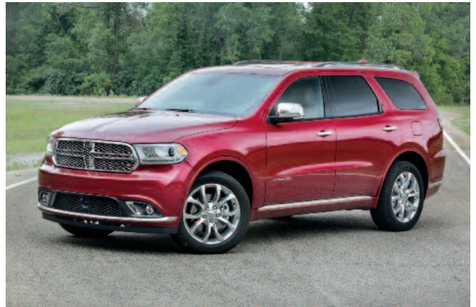
2016 Dodge Durango