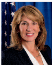
CHARLES D. BAKER GOVERNOR

A handwritten signature of Karyn E. Polito in blue ink. The signature is written in a cursive, flowing style.