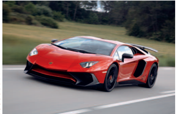
2016 Lamborghini Aventador