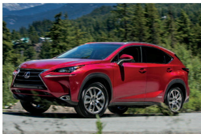
2016 Lexus NX