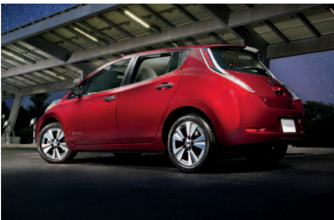
2016 Nissan Leaf