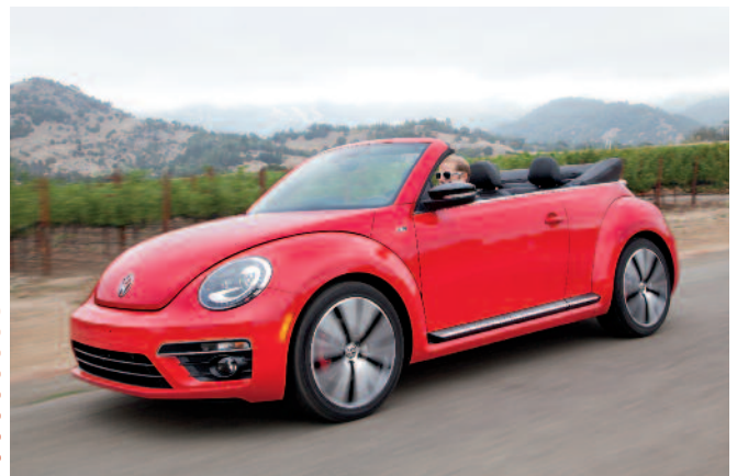
2016 Volkswagen Beetle