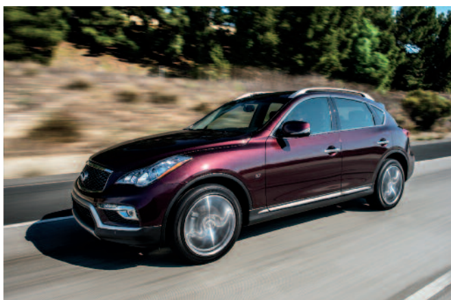
2016 Infiniti QX50