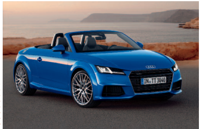
2016 Audi TT Roadster

Audi A3 Audi A5 Audi TT Audi R8 BMW 2 Series BMW 4 Series BMW 6 Series Buick Cascada Chevrolet Corvette FIAT 500 Cabrio Ford Mustang Lexus IS Mazda MX-5 Miata Mercedes Benz E-Class Mercedes Benz SL Roadster Mercedes Benz SLK Roadster MINI Convertible Porsche Boxster Porsche 911 Volkswagen Beetle Volkswagen Eos