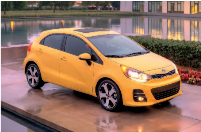
2016 Kia Rio 5-Door

Audi Allroad BMW 3 Series Sports Wagon Mercedes Benz E-Class Wagon MINI Countryman Subaru Outback Toyota Venza Volkswagen Golf SportWagen Volvo V60 Wagon Volvo V60 Cross Country Wagon Volvo XC70