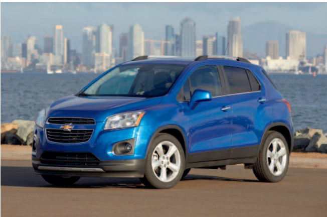
2016 Chevrolet Trax

Mitsubishi Outlander Sport Nissan Juke Nissan Murano Nissan Rogue Select Nissan Xterra Subaru Forester Subaru XV Crosstrek Toyota 4Runner Toyota RAV4 Volkswagen Tiguan Volkswagen Toureg