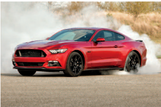
2016 Ford Mustang GT