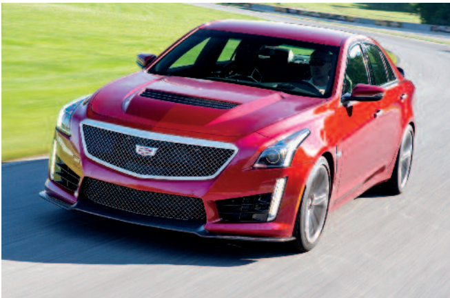
2016 Cadillac CTS

Lexus LS Mercedes-Benz C-Class Mercedes-Benz CLA Mercedes-Benz CLS Mercedes-Benz E-Class Mercedes-Benz S-Class Porsche Panamera Volvo S60 Volvo S80