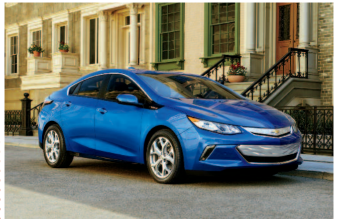
2016 Chevrolet Volt