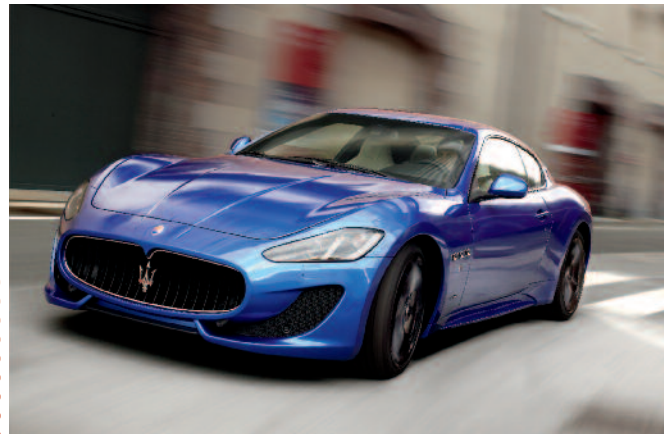
2016 Maserati Gran Turismo