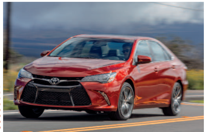
2016 Toyota Camry XSE

Vehicles are displayed at the discretion of the manufacturer. Vehicles shown here may not be displayed and are subject to change without notice.