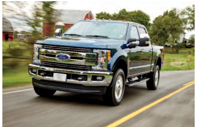
2016 Ford Super Duty