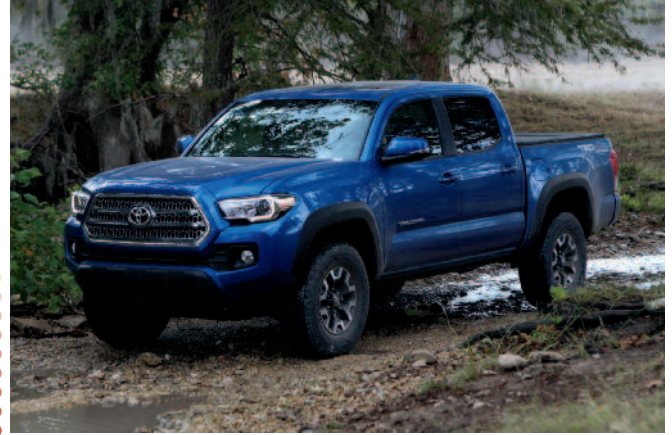
2016 Toyota Tacoma