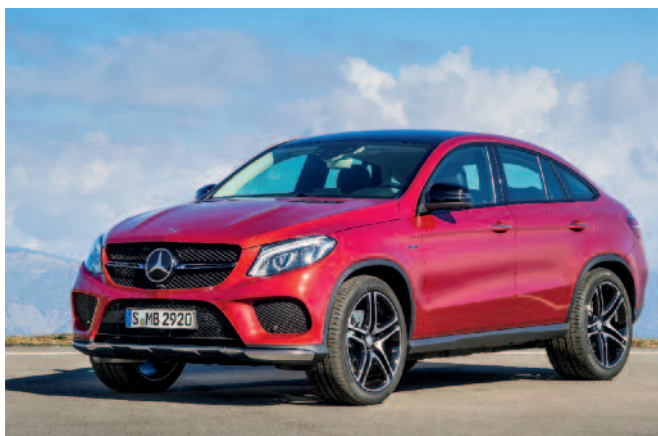
2016 Mercedes-Benz GLE 450 AMG Coupé