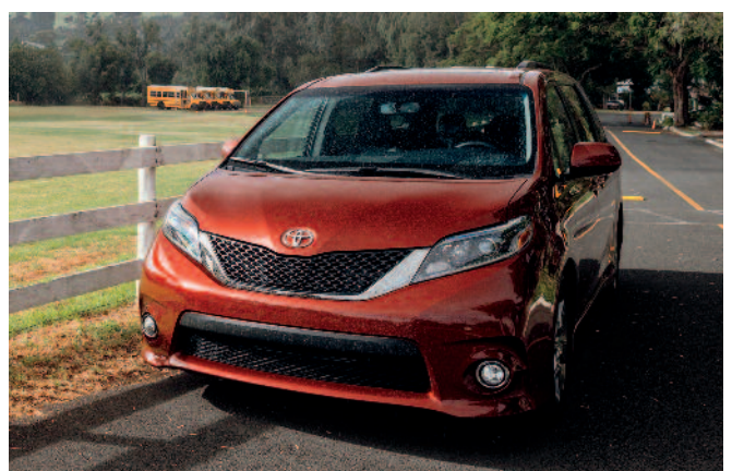
2016 Toyota Sienna