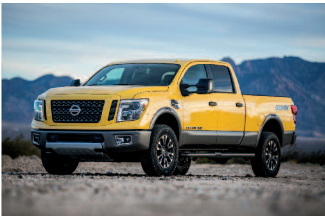
2016 Nissan Titan