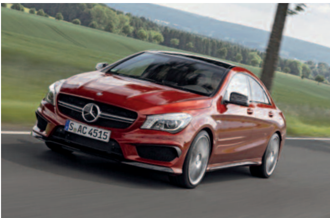
2016 Mercedes-Benz CLA