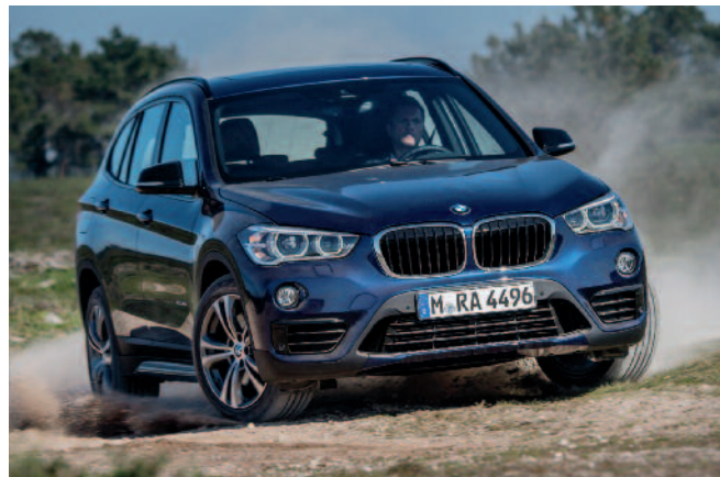
2016 BMW X1

Acura MDX Lexus LX Acura RDX Lexus NX Audi Q3 Lexus RX Audi Q5 Mercedes-Benz G-Class Audi Q7 Mercedes-Benz GL BMW X1 Mercedes-Benz GLA BMW X5 Mercedes-Benz GLE Cadillac Escalade Mercedes-Benz GLK-Class Cadillac SRX Mercedes-Benz M-Class Infiniti QX50 Porsche Cayenne Infiniti QX60 Porsche Macan Infiniti QX70 Volvo XC60 Infiniti QX80 Volvo XC90 Lexus GX