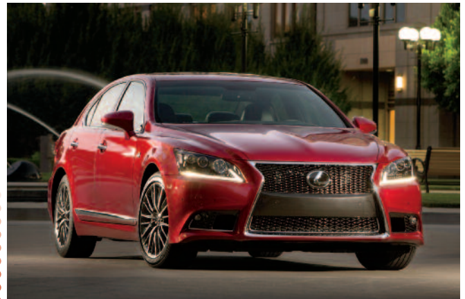
2016 Lexus LS