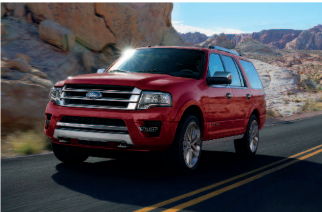
2016 Ford Expedition