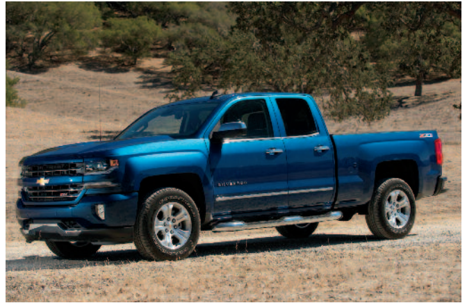
2016 Chevrolet Colorado Diesel