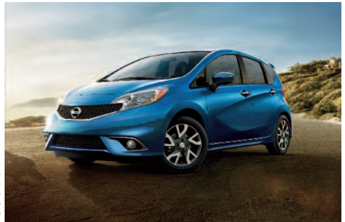
2016 Nissan Versa Note