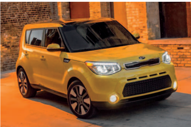
2016 Kia Soul