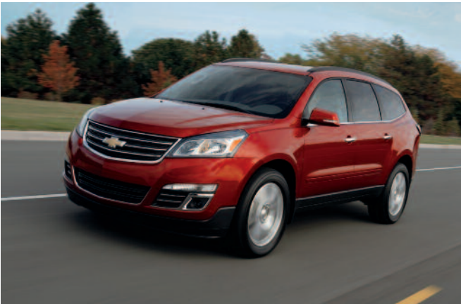
2016 Chevrolet Traverse

Chrysler Town and Country Dodge Grand Caravan Honda Odyssey Kia Sedona Nissan Quest Toyota Sienna