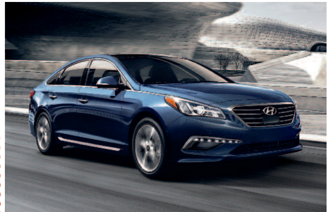
2016 Hyundai Sonata