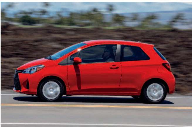
2016 Toyota Yaris