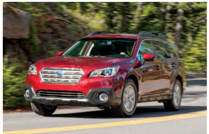
2016 Subaru Outback