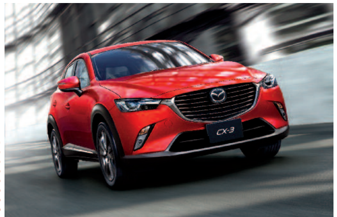
2016 Mazda CX-3