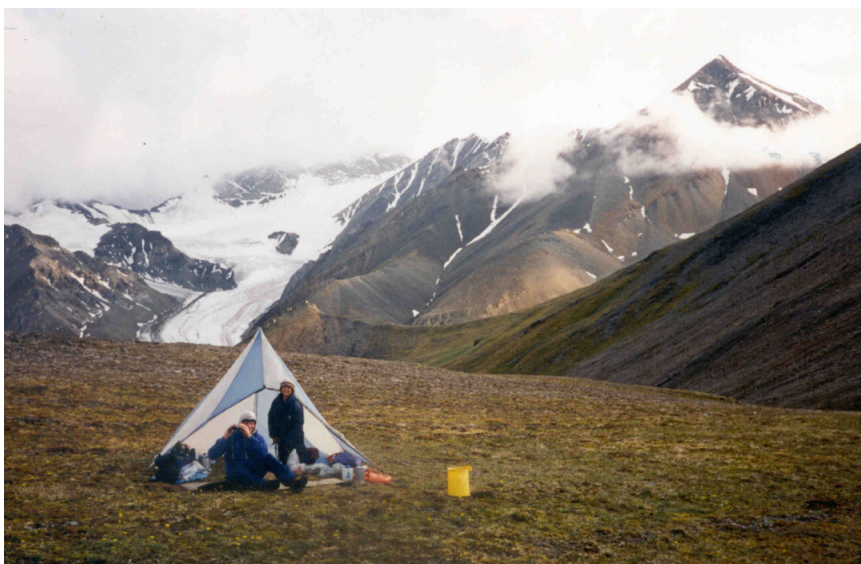
Camping in the Arctic National Wildlife Refuge