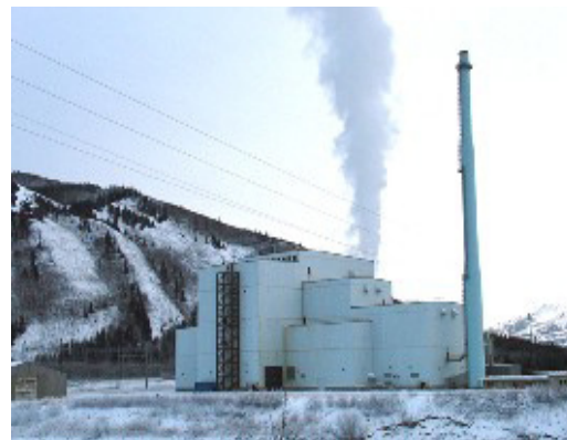
Healy Coal Plants #1 and 2; #1 is an operating plant using coal to generate electric power; it is connected to and shares a control room with the controversial plant #2

The Clean Air Act forbids any person from constructing or modifying a major source of air pollution without first securing a PSD permit ensuring that the source's emissions will be limited and not violate air quality standards. EPA guidelines require PSD review when the shut down is considered permanent. The letter argues that the plant was in a state of permanent shut down. If Golden Valley Electric's attorneys respond by alleging they don't have to comply with PSD requirements and if EPA steps in and tell them they must comply, a lawsuit could result. The hope is that the economics of additional permitting requirements will cause them to back out of the deal, thus precluding startup of the controversial facility.