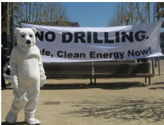
At the San Francisco hearing April 16, polar bear support is strong for safe, clean energy now!