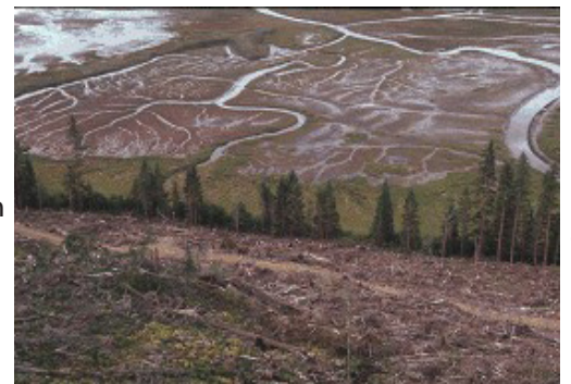
Sealaska's logging practices

mills which would get grants to stop cutting old-growth tree stands. The grants could also be used to fund a biomass to energy industry on the Tongass. Sealaska Timber Corporation