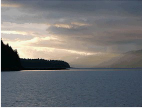
View from entrance of Hoonah Sound into Chatham Strait where many roadless areas are on the Forest Service's chopping block

by early summer. First introduced during the Bush era, this bill has had support from more than 150 co-sponsors in the past, (see alaska report , Jun 03) and there could be many more this Congress. The original roadless