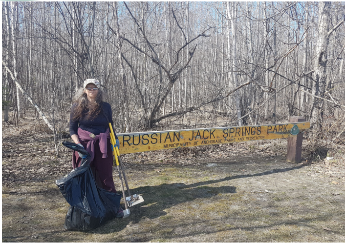
Good work at Alaska Chapter Spring Clean-up outing in Russian Jack Park