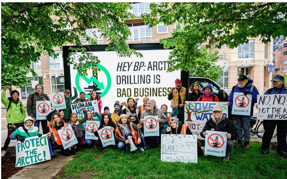
Rally Outside BP offices in Denver in mid-May

corporation British Petroleum (BP) not to bid on Arctic Refuge lease sales;