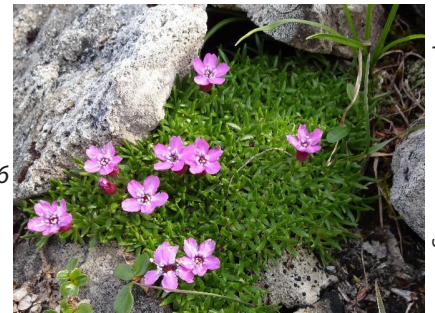
Silene acaulis (moss campion) in Western Arctic