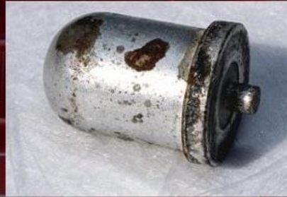
Mercury Auto Switches