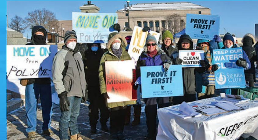
Activists gather outside the Capitol to deliver thousands of petitions to Governor Walz calling him to move on from PolyMet.

Efforts and victories like these are the culmination of many working in support of a common goal.