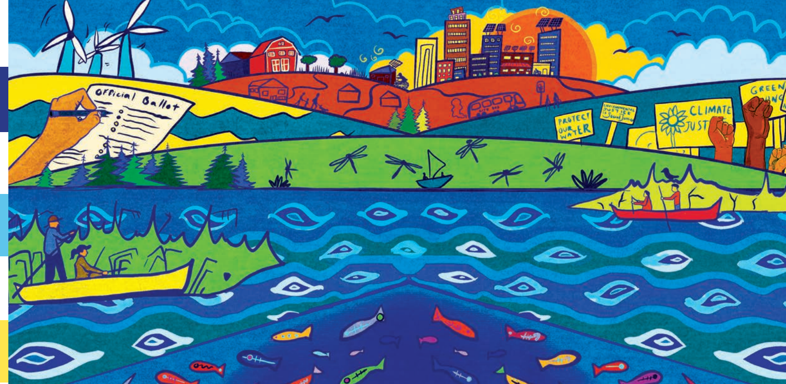
Original art by Moira Villiard