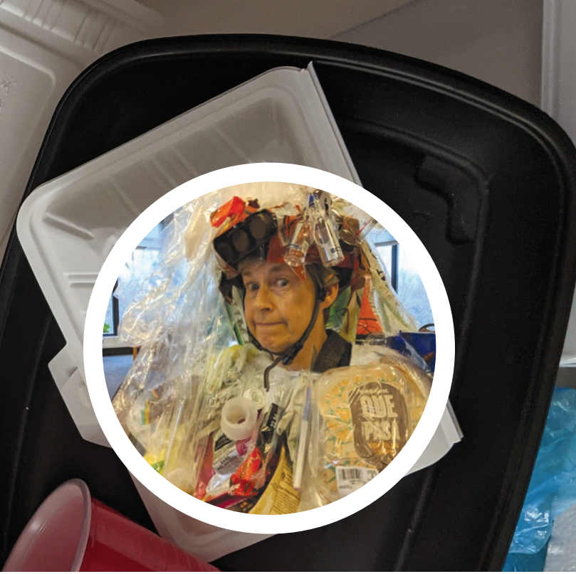
Some of the too many plastic containers found by the author.