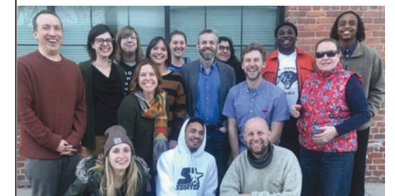
The Minnesota Sierra Club staff team 2020

Thank you for being a part of the North Star Team!