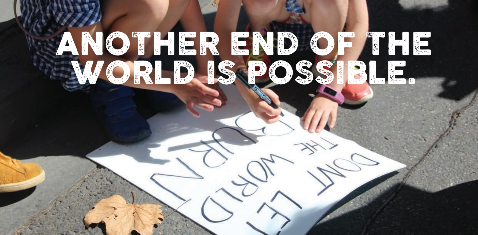
Melbourne climate strike.