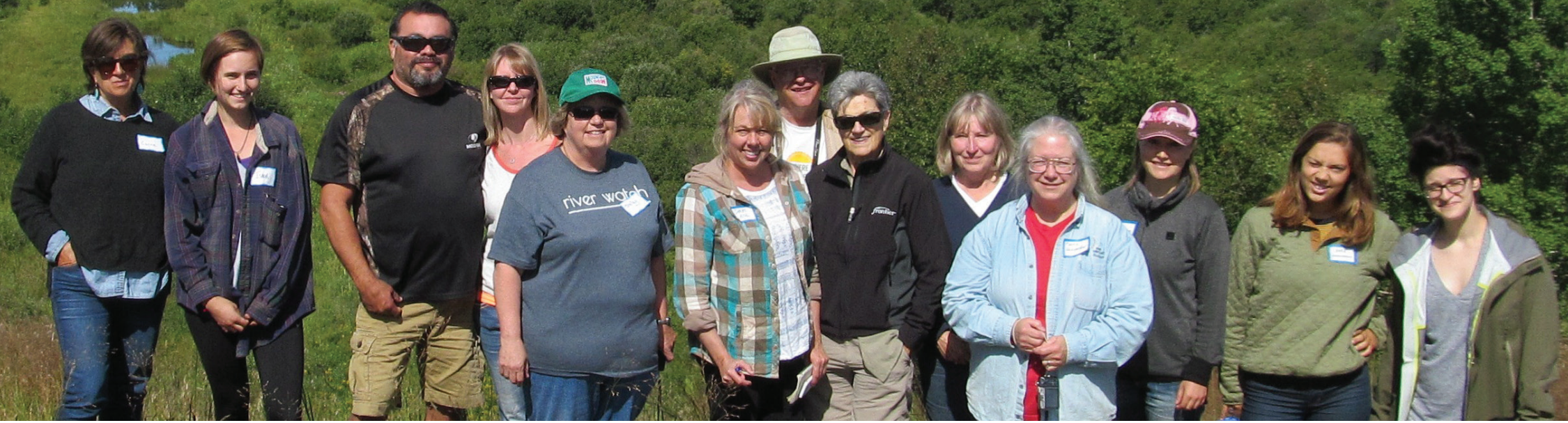
Pipeline Tour participants.