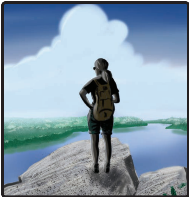
Illustration credit: Brian Bradshaw

NON-PROFIT U.S. POSTAGE PAID TWIN CITIES, MN PERMIT NO. 361