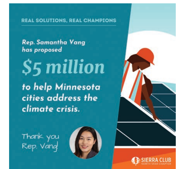
Graphics from our #RealSolutionsRealChampions campaign.