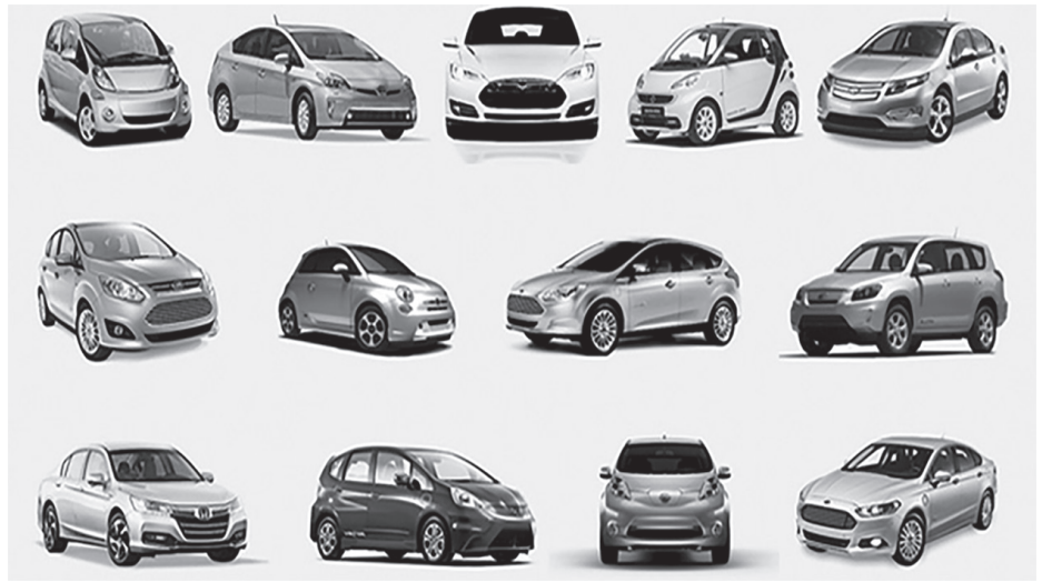
A sampling of electric vehicles available on the market today.

Just last month, Massachusetts, Rhode Island, New York, and California were among states to announce important programs to accelerate the use of EVs. Judith Judson, the Massachusetts Department of Energy Resources Commissioner, shared at the New England Auto Show that the 'Massachusetts Offers Rebates for Electric Vehicles' (MORE-EV) program would receive $2 million in new funding, and Rhode Island subsequently became the latest state to add an EV consumer rebate program. In California, the Public Utilities Commission approved the Southern California Edison's "Charge Ready" program, which will open 1,500 new charging stations and educate customers about the benefits of driving an electric vehicle. In New York, Governor Cuomo recently