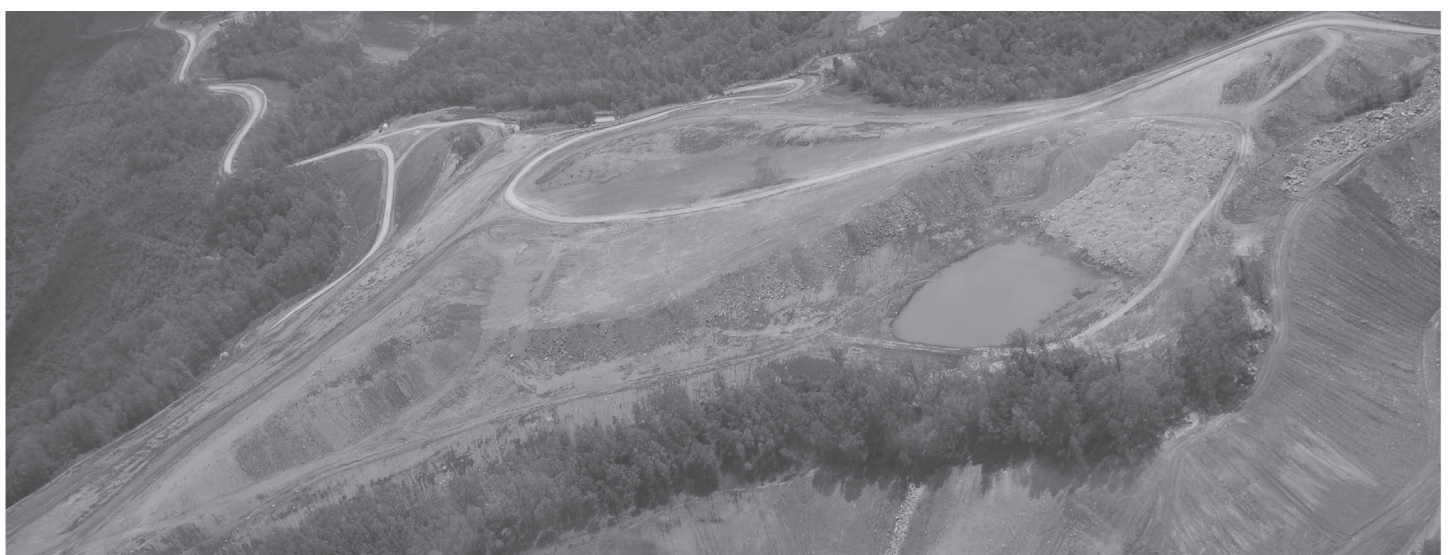
Zeb Mountain site in Tennessee.