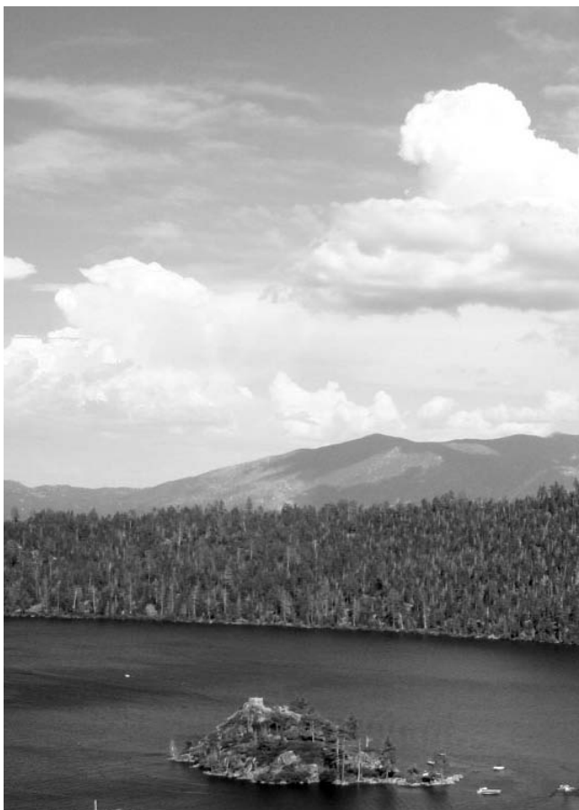
Emerald Bay, Lake Tahoe.