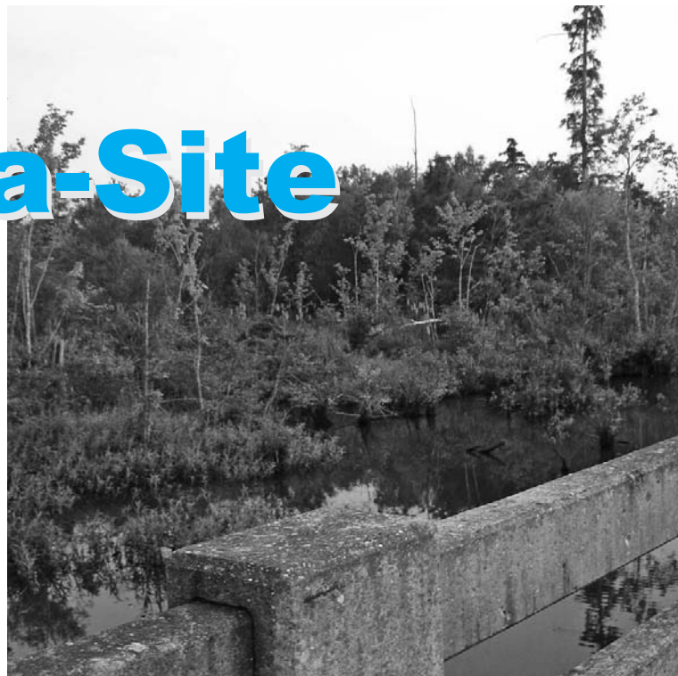
Above and Below: Here are some of the wetlands near the Hatchie River that this project will impact.