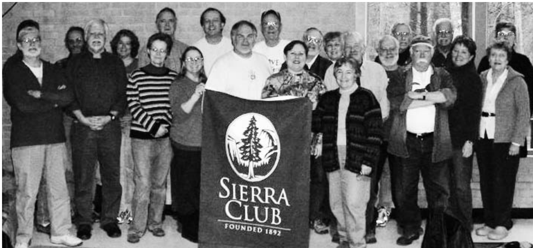
Attendees of the Winter 2007 Tennessee Chapter Sierra Club Meeting held in January at Cedars of Lebanon State Park.