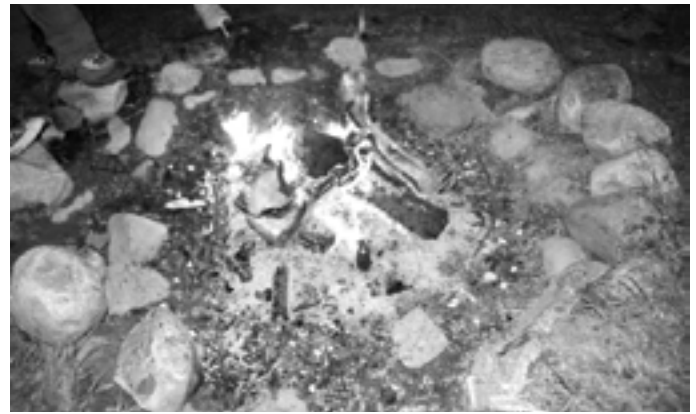
↑ Popcorn and storytelling around the campfire gave members from around the state a chance to connect.