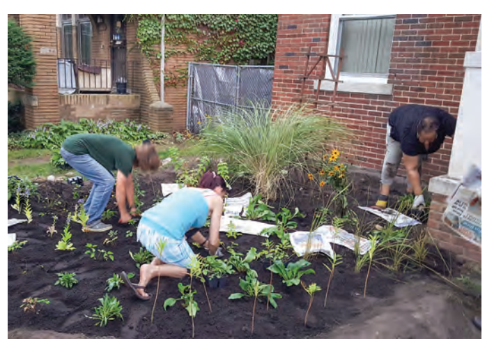
Sierra Club and partner Friends of the Rouge have installed more than 80 rain gardens in Detroit.