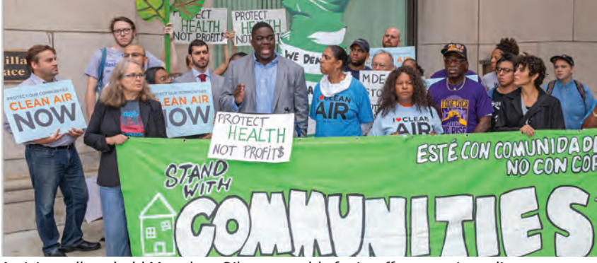
Activists rally to hold Marathon Oil accountable for its effects on air quality.

Efforts surrounding the AK Steel facility have also been successful. Recently, attempts to block the company from tripling levels of lead and manganese emissions were productive after sustained community pressure from surrounding residents, Sierra Club, lawmakers and other advocates.