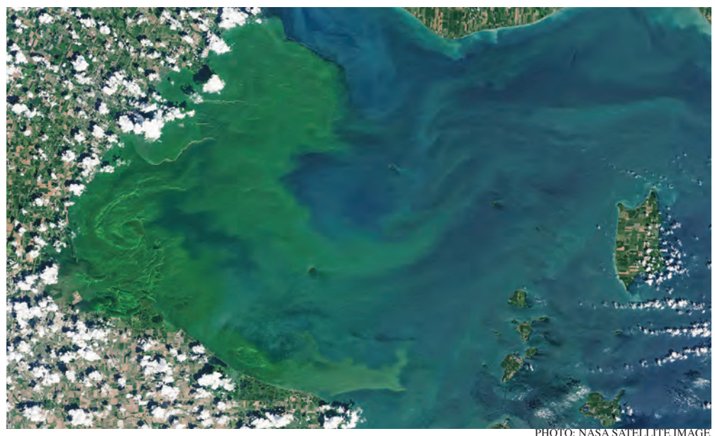
can be applied to and restrictions based In July 2019, a toxic algae bloom spread across the western half of Lake Erie.

The Michigan Environmental Council is heading up a legal response by several groups intervening in the appeal process which will include giving testimony this spring. In the meantime, Sierra