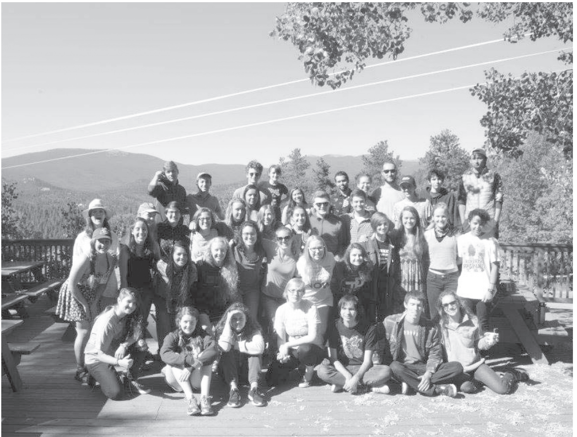
2016 SPROG attendees

I ended up having half of a notebook full of useful information that I will continue to put to use in my personal activism around my campus, within my community, and across the globe. I want to personally thank the Tennessee Chapter and the Cherokee Group for financially aiding me in the trip. It was one of the most memorable experiences of my life and I look forward to working in solidarity with groups around the world to bring environmental justice and help protect our beautiful natural world.