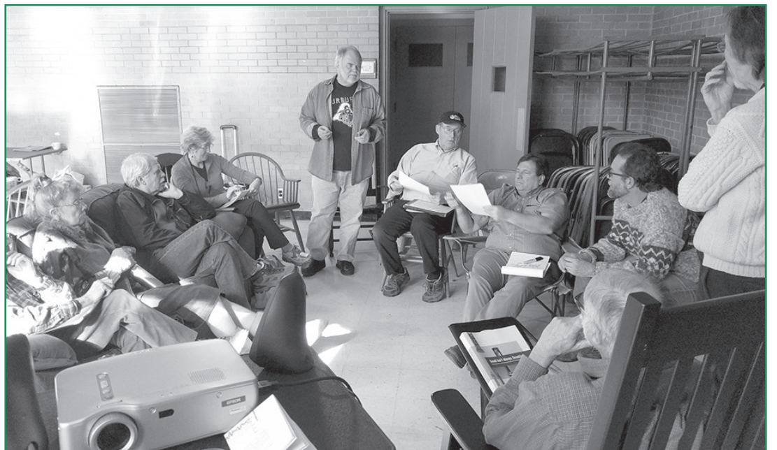
Below: Saturday's Conservation Committee Meeting