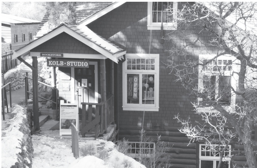
Photo of Kolb Studio

Learn more about these colorful and resourceful brothers at the Tennessee Chapter Retreat.