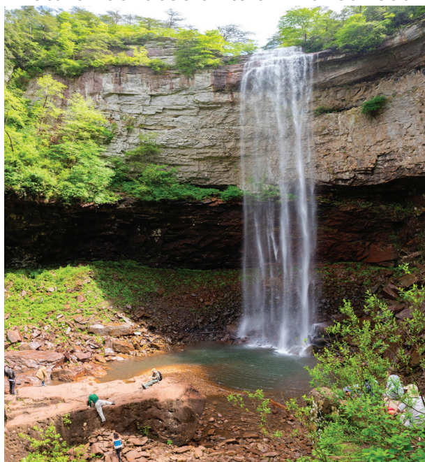
Fall Creek Falls

Nature had ideas of its own for our Sat-