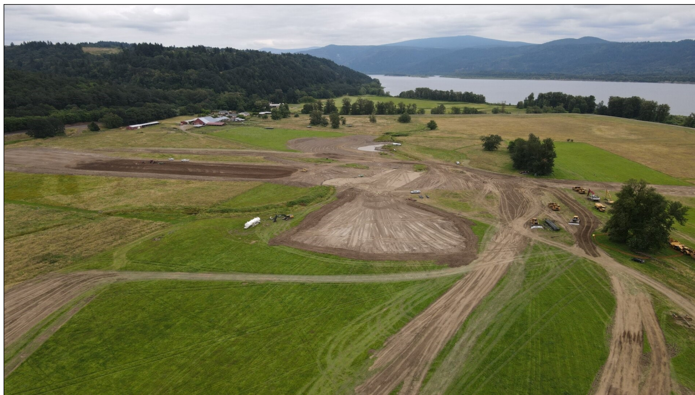
An overhead shot of the construction area at Steigerwald Lake.

At Loo Wit's 2019 holiday party, we learned about the 965-acre floodplain restoration project at Steigerwald Lake National Wildlife Refuge. Much progress has been made since that time, including two major milestones in the last few months. In May, contractor Rotschy, Inc. began removing 2.2 miles of the existing levee separating the Columbia River from its floodplain. Material removed from the levee is being used to build two new setback levees that will mitigate flood risk for neighboring properties, including the Port of Camas-Washougal. At the beginning of July, a massive concrete water diversion structure was removed. The structure was built in 1992 to disconnect Gibbons Creek from the floodplain. Its removal will allow the creek to be reconnected to its floodplain and alluvial fan, enabling juvenile salmon and lamprey to pass through the Refuge out to the Columbia. Before the diversion structure was demolished, all fish and shellfish were removed from the affected section of Gibbons Creek, which has been temporarily rerouted through a culvert. Washougal contractor LKE, Inc. is reconstructing the creek's historic channel and building wood habitat structures. This construction is slated to be complete in November. The Lower Columbia River Estuary Partnership will then begin planting trees on 170 acres of riparian habitat, and the refuge will reopen to the public in spring 2022.