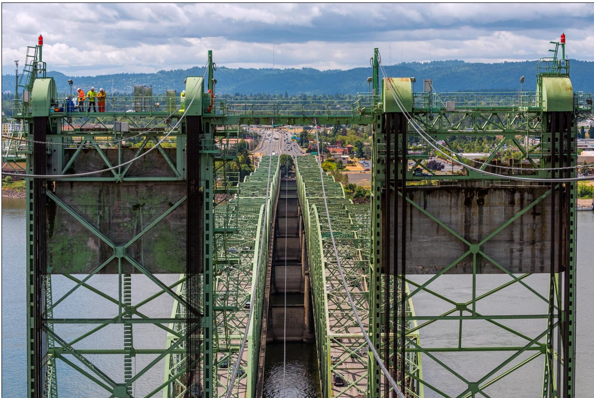
The Interstate 5 bridge looking south.

Most of the above comments are relevant to City and County streets. Please get involved with The Vancouver Transportation and Mobility Commission: https://www.cityofvancouver.us/TMC