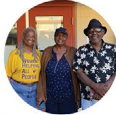
GOLDEN GATE VILLAGE RESIDENTS COUNCIL