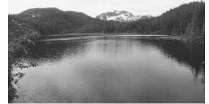
Lower Slate Lake

The production of a single 18 karat gold ring weighing less than an ounce generates at least 20 tons of mine waste. The real cost of the gold has to include the costs of what we lose. The worth of wetlands and water quality. The value of culture, floodplains, recreation, fish & wildlife. The price of pristine.