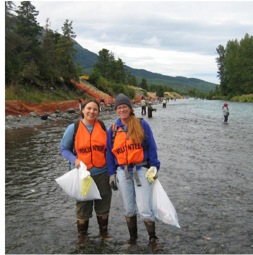
photo: Russian River angler