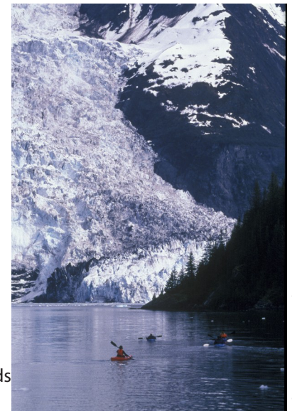
Prince William Sound, Chugach Forest