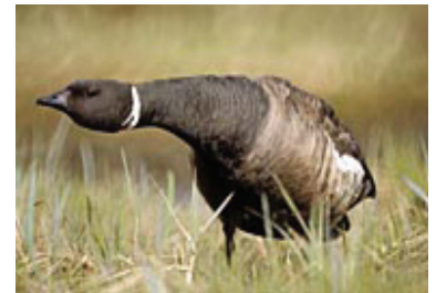
Black brant at T-Lake

Sierra Club has not opposed leasing in most of the vast 23-million acre National Petroleum Reserve-Alaska, but has insisted on keeping the identified "Special Areas" in the NPRA closed to development. These include Teshekpuk Lake, the Colville River watershed, Kasegaluk Lagoon, and the Utukok River Uplands. (see map, page 2)