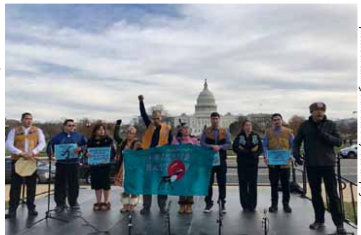
Members of the Gwich'in Nation of Alaska and Canada in Washington, D.C. at a prayer on Capitol Hill, led by the Gwich'in Steering Committee and the Indigenous Environmental Network.