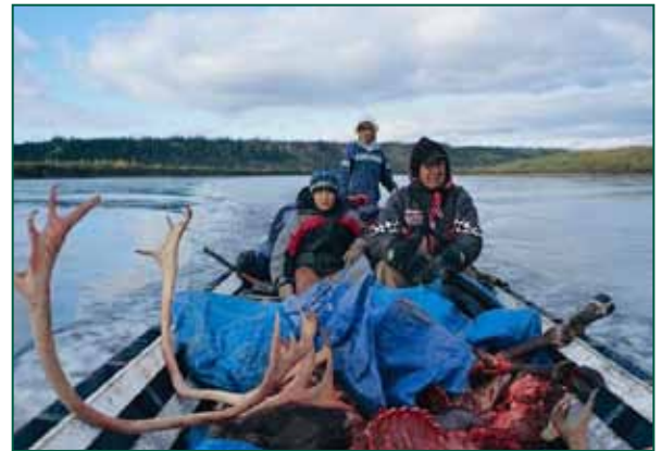
A Gwich'in family on the Porcupine River near Old Crow, Canada

The Gwich'in people of Alaska and north-west Canada have staunchly opposed opening the Arctic Refuge to drilling for the significant damage it would cause to the Porcupine caribou herd, which uses the 1002 Coastal Plain area as its calving ground. Their traditional subsistence livelihood depends on the caribou. They follow the caribou--which winter in the watershed of the Porcupine River in the Canadian Arctic and come to the coastal plain of the Refuge to give birth to their calves and nourish them in summer. The sea winds off the Arctic coast give them needed relief from mosquitos and other summer biting insects.