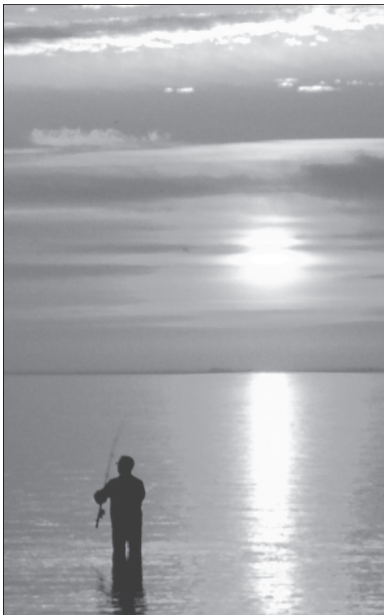
Dreaming of Fishing on the Coast