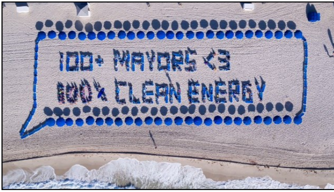
More than 120 people helped create this aerial human text message calling for mayors to join the campaign for 100% clean energy.