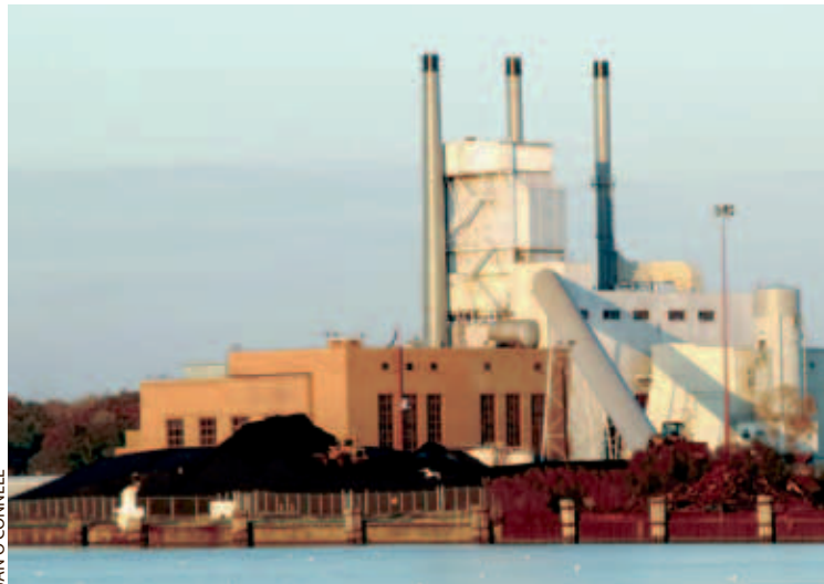
James DeYoung coal plant, Holland Board of Public Works.

Wolverine Power Supply Cooperative's proposed Rogers City coal plant is expected to be cancelled this year after the Co-op claimed EPA emission requirements would make it difficult to build. This spring Wolverine began discussions with WE Energies about potential collaboration on upgrading the Presque Isle plant in Marquette instead. WE Energies announced in 2011 it would close that plant to avoid paying to upgrade pollution equipment. The Presque Isle plant provides half the power in the UP with 80% of its output going to the iron mines west of Marquette. Among alternatives under consideration to replace that power are running massive power lines from Wisconsin coal plants or from Manitoba water power sources, however