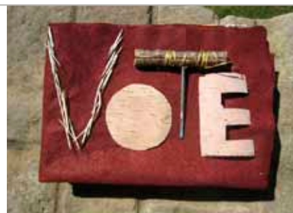
Election details pp. 4-7.