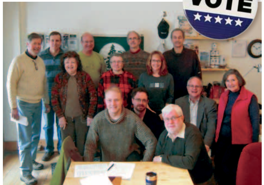
Michigan Chapter Political Committee

RMB: Everyone can do something — write a check to our Political Action Committee or volunteer for a campaign. We need to get all people concerned about the environment personally involved. For details, email mike.berkowitz@sierraclub.org or call 517-484-2372, ext. 13.