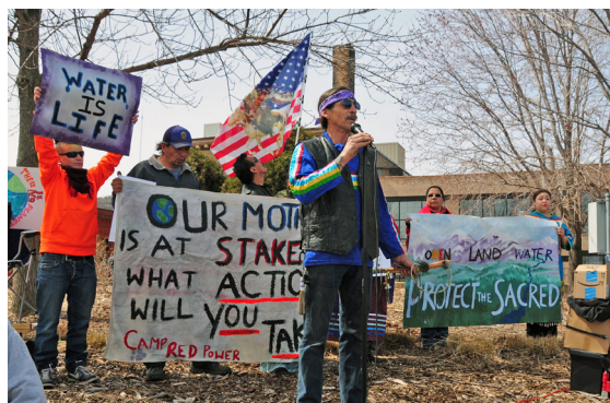
Duluth

Nearly 700 people joined the Duluth People's Climate March from Leif Erikson Park, along the Lakewalk to Lake Place Park on April 29. Local organizers from the Sierra Club Clean Energy Team and Minnesota Interfaith Power & Light invited local environmental and social organizations among them