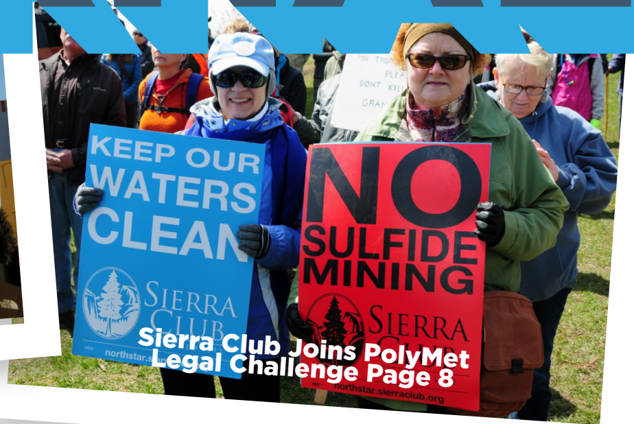
Sierra Club Joins PolyMet Legal Challenge Page 8