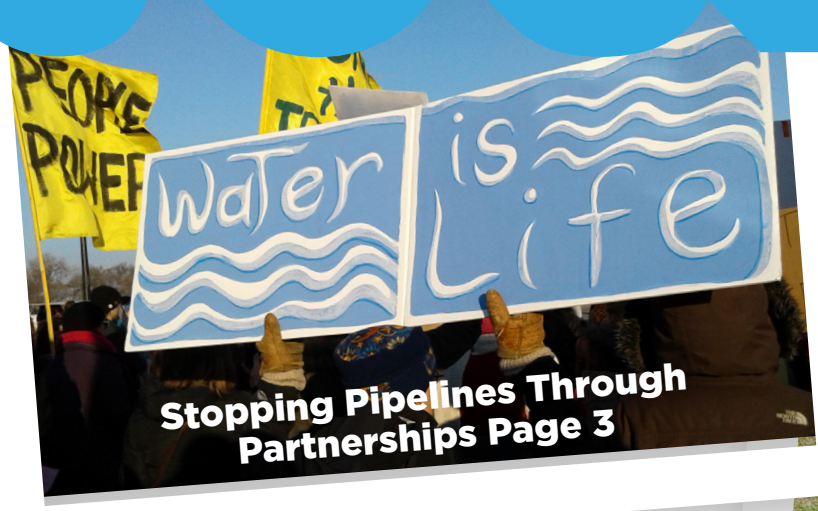
Stopping Pipelines Through Partnerships Page 3