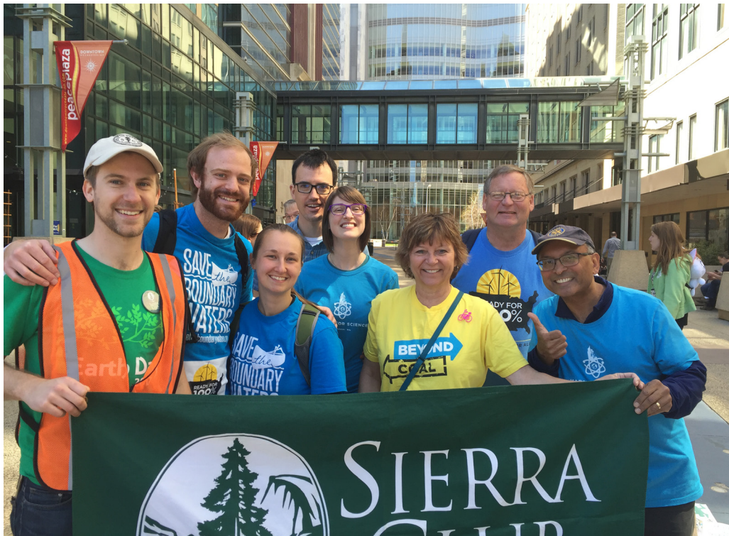
Rochester