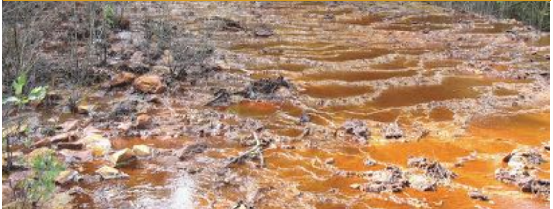
Acid Mine Drainage in a stream

On March 27, 2017, the Sierra Club joined with Save Our Sky Blue Waters and the Save Lake Superior Association in filing legal action against the U.S. Forest Service (USFS) land exchange with PolyMet.