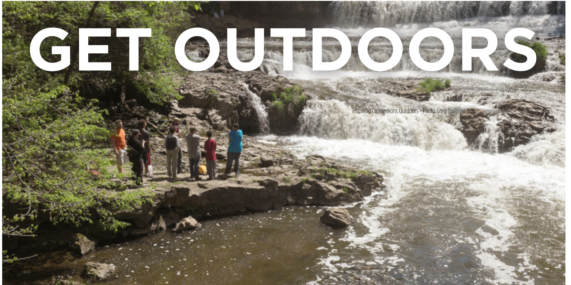
Inspiring Connections Outdoors