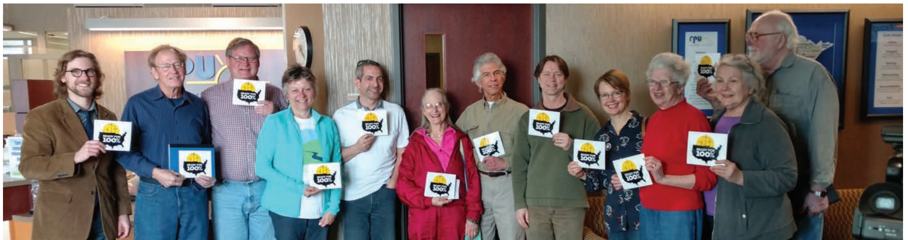
Rochester Sierra Club activists celebrate outside of the Rochester Public Utilities (RPU) board room moments after securing a commitment from RPU to create a plan for 100% renewable energy.