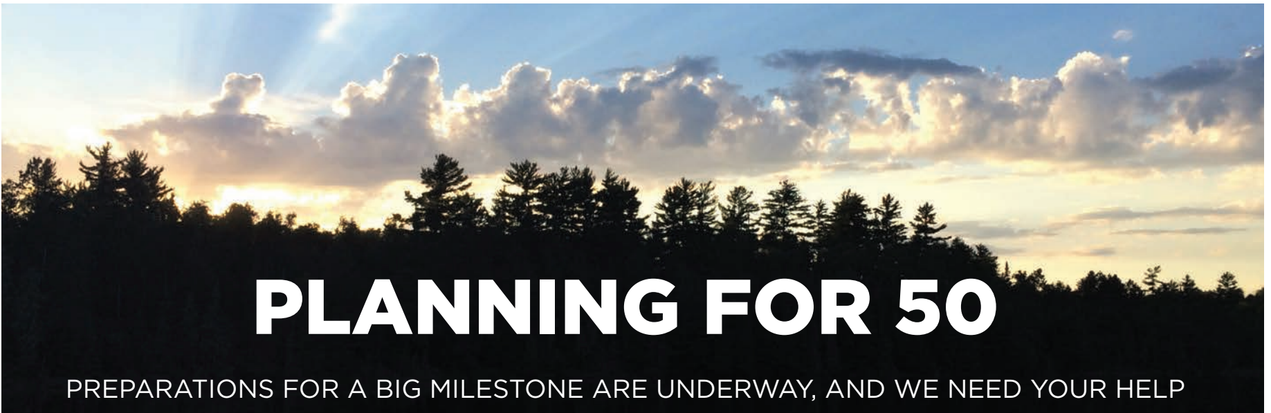
Bear Head Lake State Park.