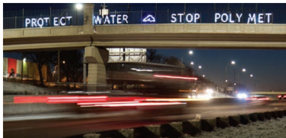
Volunteers create a lighted sign over I-94 in Saint Paul.

Yet our politicians continue to push the toxic PolyMet sulfide mine forward. Their latest plan is to override four separate lawsuits filed by eight