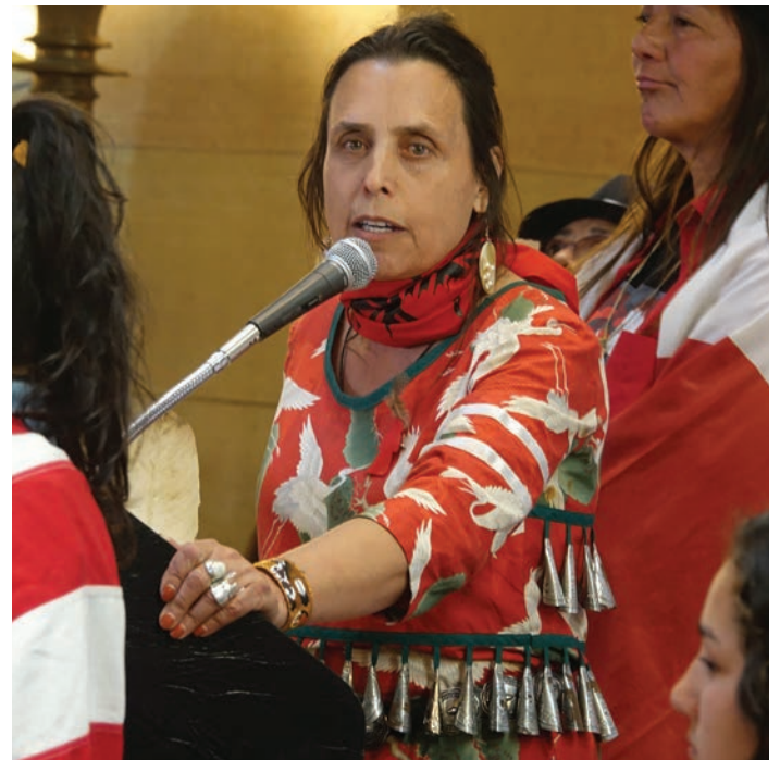
Winona LaDuke speaks at Water Action Day, one of our effective coalition lobbying efforts during the 2018 Legislative Session.