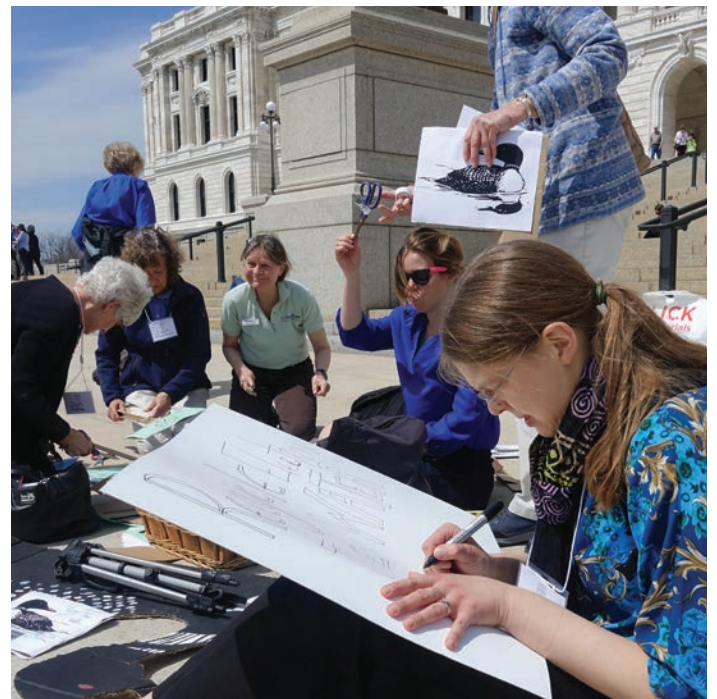
Volunteers making signs for Water Action Day.