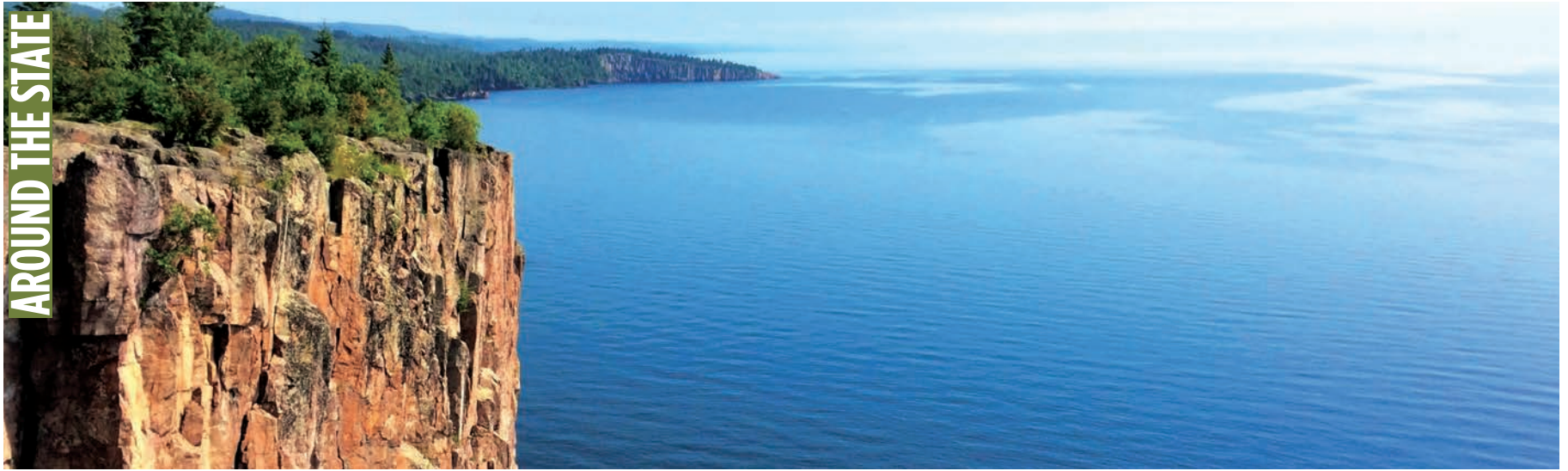
Palisade Head - Silver Bay, MN