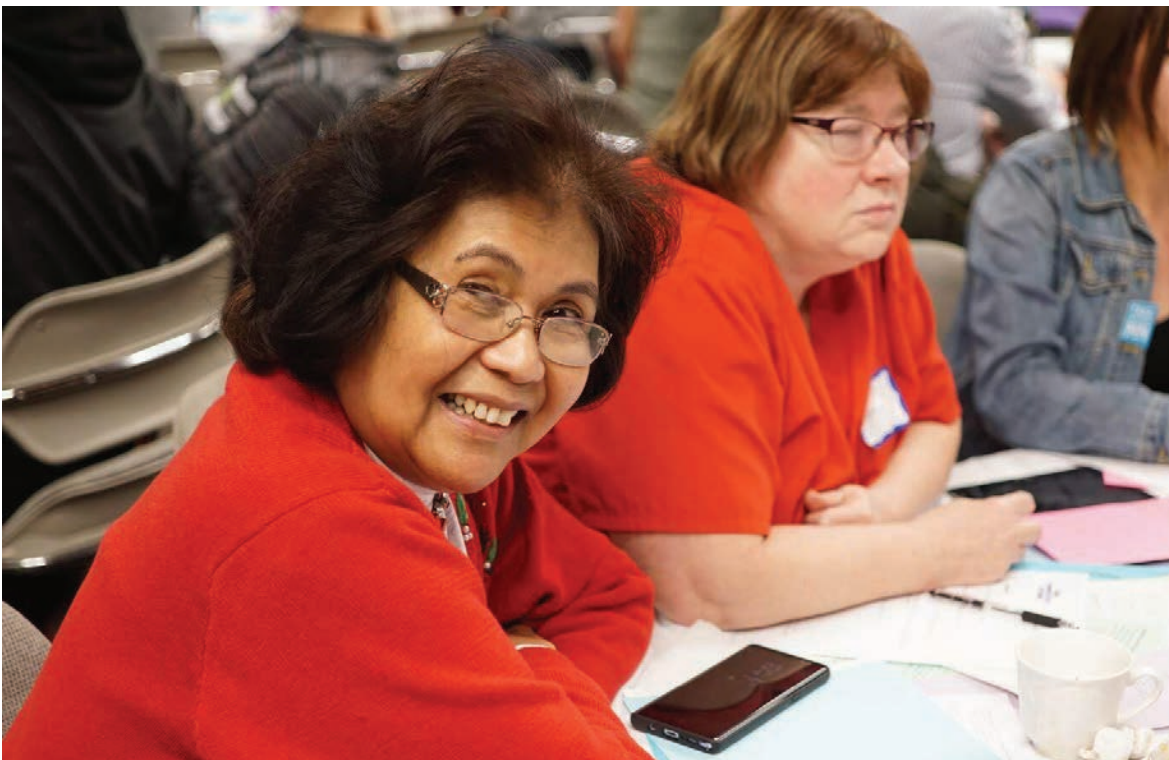
Minnesotans gather for the OMF December Assembly.