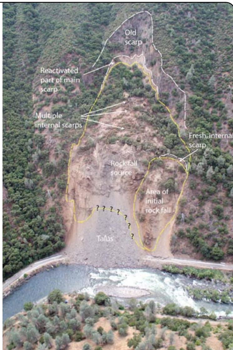
Oblique aerial photograph of Ferguson Rock Slide. Dashed (yellow) lines indicate extent of the rock slide based on visual inspection. Rockfall source area, talus, and new scarps are indicated. Photo taken by Ed Harp, USGS on June 13, 2006. Additional information on the slide is available at http://www.fs.fed.us/r5/sierral/conditions/ferguson-chron.shtml .

During construction, traffic would continue as at present on the existing bridges. Because the project is between the existing bridges, they anticipate minimal disruption of traffic. In order to expedite construction of the new bridges, removal of the old bridges will be done later, as