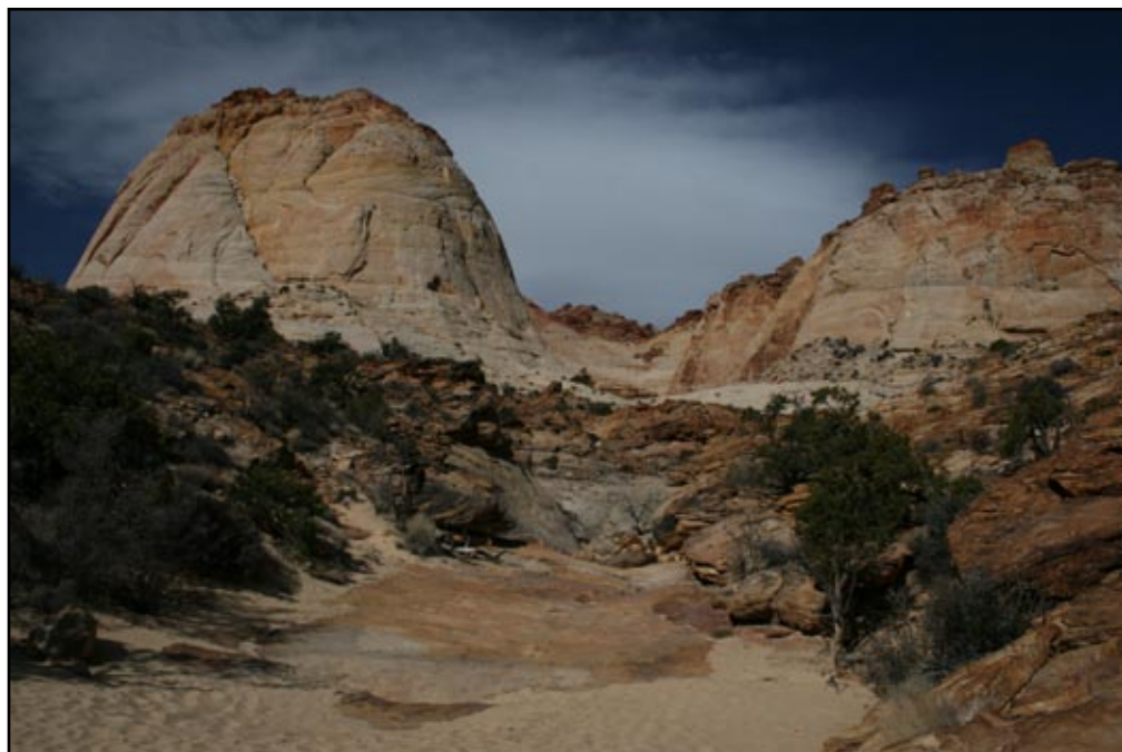
Your Topics editors sneaked away for a vacation. The picture above was taken in Capital Reef National Park