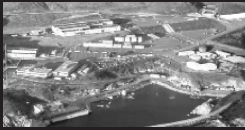
Spent nuclear fuel is stored in the Diablo Canyon yard (the plant is just to the left, out of the photo). Imagine the result of a tsunami hitting this facility. A significant tsunami reached the California coast following the March 11th earthquake that devastated Japan.

It is a Faustian bargain in one sense because, at least figuratively, it is making a deal with the devil. The very name plutonium, one of the elements involved in nuclear fission and occurring in at least one of the reactors at the Fukushima plant, comes from the Roman god of the underworld, Pluto, the lord of hell. Like the trickster Satan, symbolically related to Pluto, the nuclear reaction is very hard, if not impossible, to control. In the film Chinatown , the manager of a nuclear power plant played by Jack Lemmon explains to a reporter played by Jane Fonda, that his facility has deep protection because it has backup systems for its backup systems in order to keep what is very hard to control under control—a managed chain