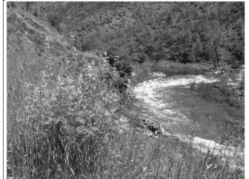
Merced River in Mariposa County

Since 1991 we have had a good balance between conservation and recreation upstream of 867' and agriculture and power production downstream. HR 869/2578 violate the present balance; more importantly they violate the essence of the National Wild and Scenic Rivers Act by removing a beautiful stretch of "Wild" river for inclusion within a reservoir. They set a terrible precedent.