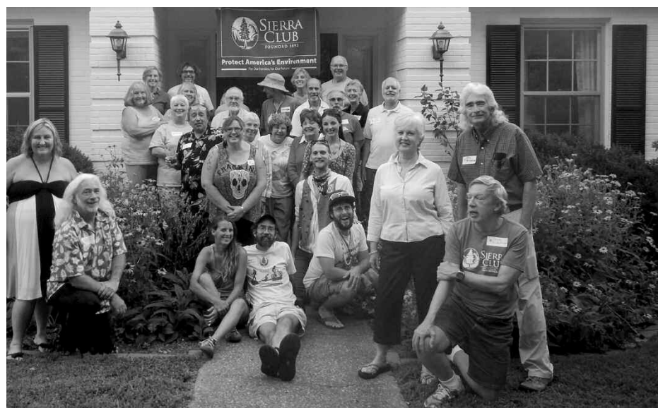
Sierrans gather at the July Chapter meeting in Nashville. Mark your calendar for the October 17, 18, & 19 meeting at Pickett State Park! This will be a great meeting for newcomers because there will be lots of hikes and activities.

http://earthroot.net/frackconference/take-action/