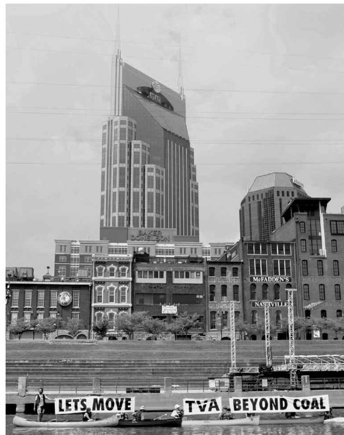
"Sierrans from across State gather in Nashville to press TVA to Move Beyond Coal"

The new report also reviewed red-line copies of the EPA's proposed coal plant water pollution standards or "effluent limitation guidelines" obtained through Freedom of Information Act requests, finding that the White House's Office of Management and Budget (OMB) caved to coal industry pressure and took the highly unusual and improper step of writing new weak options into the draft guidelines prepared by the EPA's expert staff.