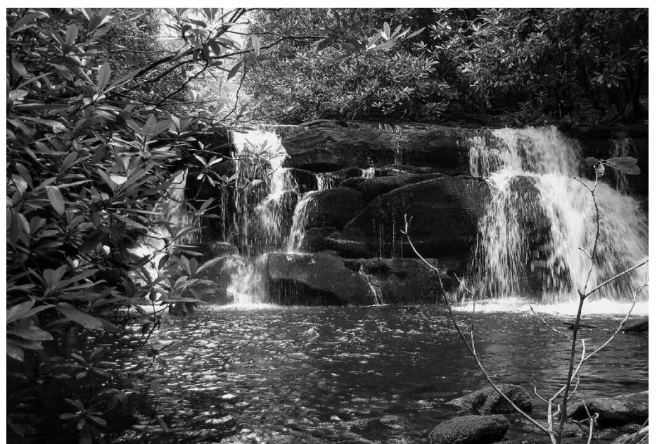
Tennessee Falls along the Bald River Trail in the Upper Bald River WSA, taken on a June 2011 TN Wild day hike with various congressional, media and foundation representatives.