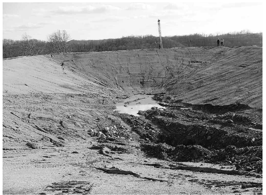
The storage pond that will hold fracking fluids took more off the mountain top.

When fracking came to Doddridge County, everything changed for the people and their land. As one resident told us, “This is not your grandfather’s gas well. Fracking has ruined our county. Don’t let it happen where you live!”