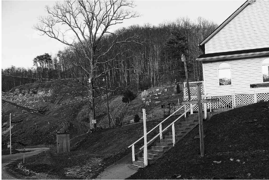
A road being constructed to the well site passes close to a cemetery and church.

I never fully comprehended how this process can transform a beautiful rural community into a wasteland. It is more than just a natural gas well. Fracking includes clear cutting, mountaintop removal, and massive road building. It causes pollution of the air, streams, and groundwater. Compressor stations are like factories and public roads