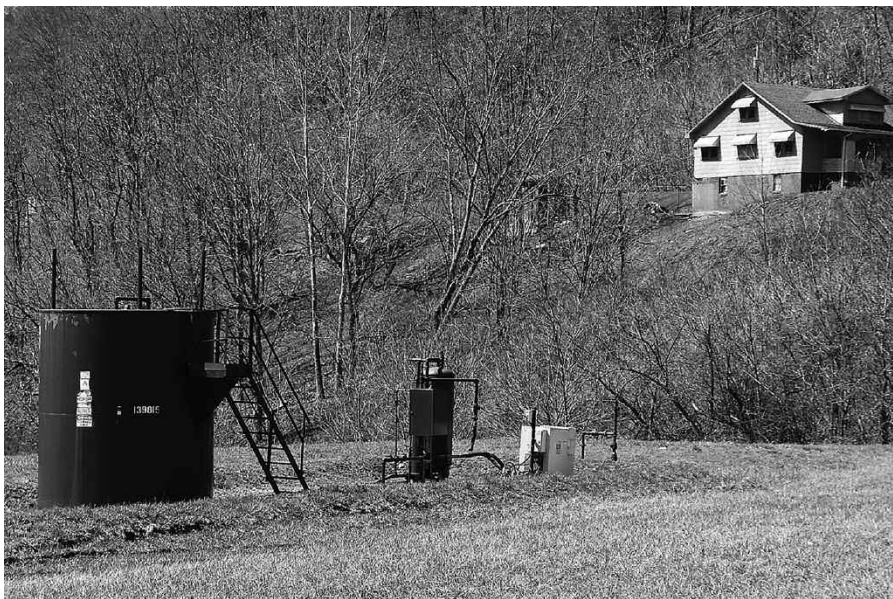
The old well site has a storage tank and pump coexisting with a nearby home and forest.

are often crowded with large tanker trucks. Water is frequently drawn from local streams and mixed with unknown chemicals to fracture shale thousands of feet below the surface. Four to six million gallons of water may be used to frack a single well.